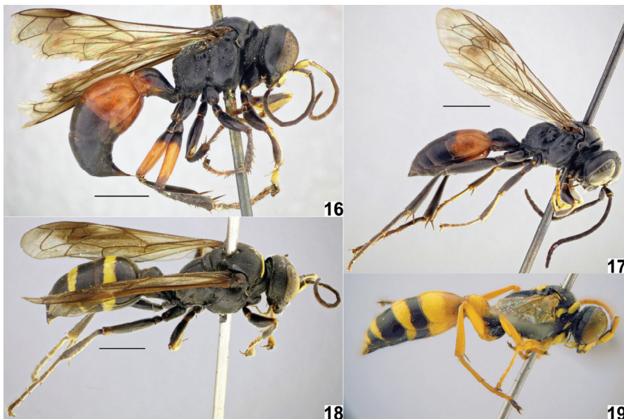
Figs 16–19. Lestiphorus oreophilus (Kuznetsov-Ugamskij) (16, 17), L. pacificus Guss. (18) and L. pictus Nemkov (19), habitus, lateral view. 16, 18 – females; 17, 19 – males (16 – from Kazakhstan; 17, 19 – from Kyrgyzstan; 18 – from Russia, Primorsky Terr.). Scale bars: 2.0 mm. (Fig. 19 – photo by Yu.V. Astafurova).