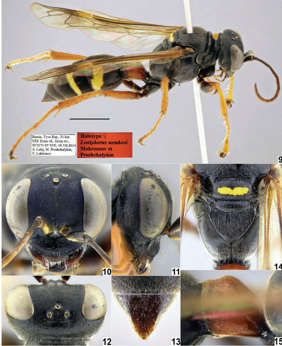
Figs 9–15. Lestiphorus nemkovi sp. n., holotype, female. 9 – habitus, dorsolateral view and labels; 10–12 – head, frontal view (10); lateral view (11); dorsal view (12); 13 – pygidium; 14 – scutellum, metanotum and propodeum, dorsal view; 15 – T1, dorsolateral view. Scale bar: 2.0 mm.

slightly not reaching the apex. Propodeal slope with median furrow. Pronotal collar with dense micropunctuation and scattered small punctures; mesonotum and scutellum with dense micropunctuation and scattered irregular large punctures; metapostnotum with space micropunctuation and punctures; mesopleuron with not dense micropunctuation and scattered irregular large punctures, ventrally shagreened and poorly visible punctures; metapleuron