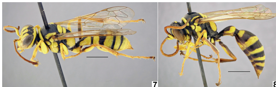
Figs 7–8. Lestiphorus egregius (Handlirsch), habitus. 7 – female, dorsolateral view; 8 – male, lateral view (7 – from Turkmenistan; 8 – from Uzbekistan). Scale bars: 2.0 mm.

DISTRIBUTION. Armenia, Turkey, *Turkmenistan, Uzbekistan, Tajikistan.