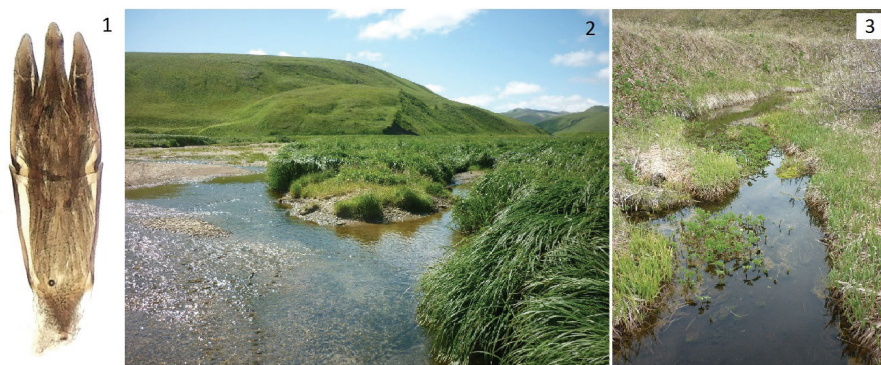
Figs 1–3. Helophorus auricollis . 1 – male genitalia, dorsal view; 2, 3 – habitat on the Bering Island (floodplain of Buyan River).

DISTRIBUTION. Russia (East Siberia, Russian Far East), North America (Fikáček et al. , 2015).