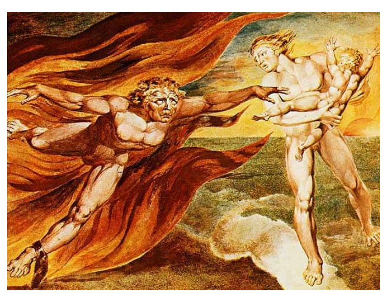
Figure 6. The Good and Evil Angels, cca. 1790.