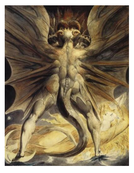
Figure 5. The Red Dragon and the Woman Clothed with the Sun. 1805-10.