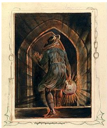
Figure 2. Frontispiece to Jerusalem. 1804-20.