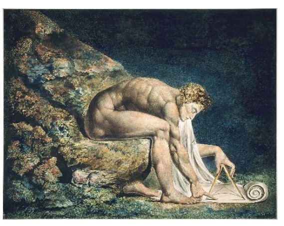
Figure 4. Newton. 1795. Collection Tate Britain.