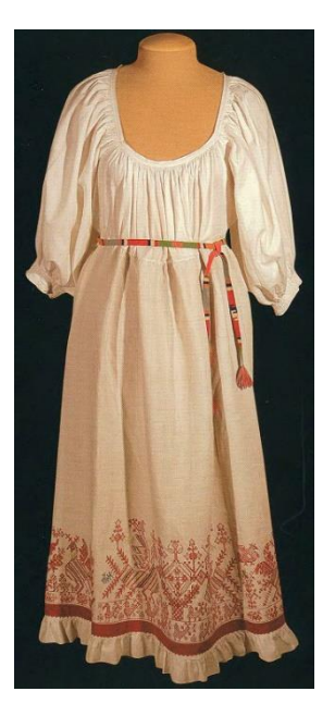
Figure 29. Shirt 'pokosnitsa'. The late 19th and early 20th century. Olonets Province, Kargopol County. It consists of two parts