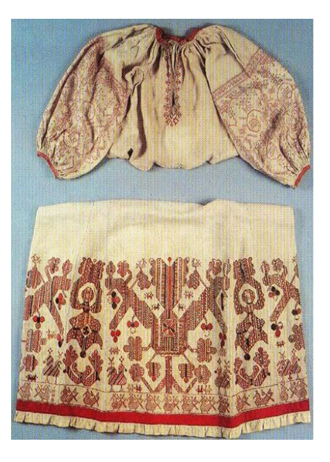
Figure 23. A girl's costume. The late 19th century. Details of a woman's shirt. The second half of the 19th century. Russian North