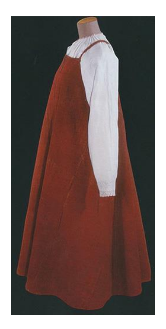
Figure 8. Wedding girl's costume: ceremonial shirt 'healer', bright red cloth oblique-wedge sundress – 'ponitok'. The middle and late 19th century Arkhangelsk Region.