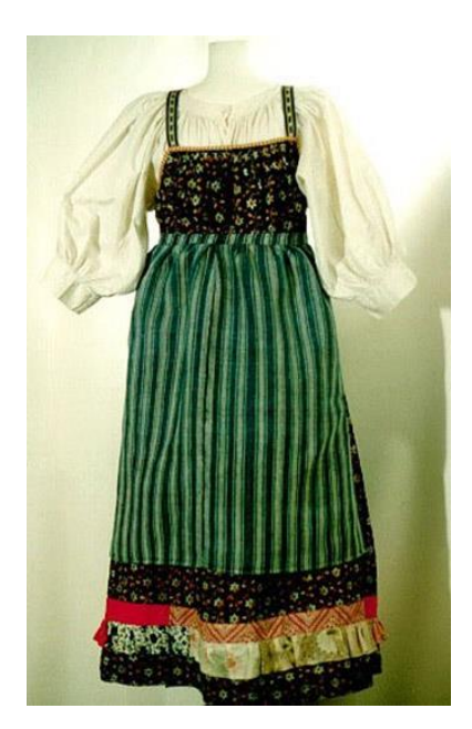
Figure 10. Women's harvest suit. The early 20th century Olonets Province, Kargopolye. Shirt, sundress: linen fabric, coloured fabric, kumach, calico, hand weaving.