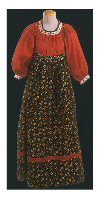
Figure 33. Festive women's costume of the late 19th and early 20th century. Olonets Province, Kargopol County. It consists of a shirt and a sundress 'nabivalnik'