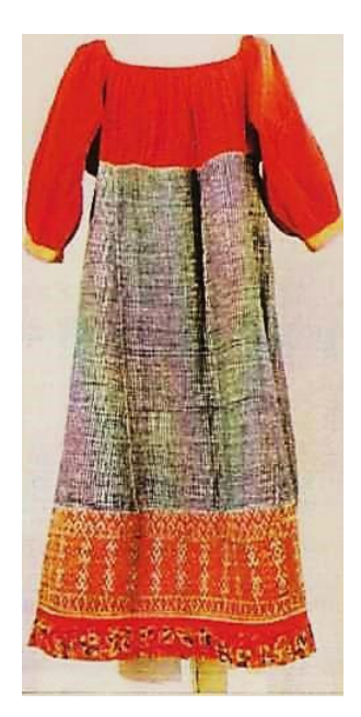
Figure 11. Women's reaping suit. The early 20th century. Olonets Province, Kargopolye. Shirt, sundress: linen fabric, coloured fabric, kumach, calico, hand weaving