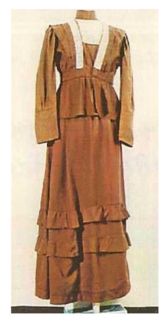
Figure 2. Festive women's Urban costume 'couple'. The late 19th and early 20th century. Arkhangelsk. Jacket, skirt, cotton fabric, tulle