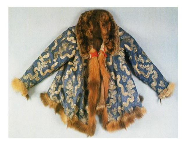
Figure 18. Women's fur coat. The second half of the 19th century. Arkhangelsk Region. Fur of sable, marten, ermine, fox, arctic fox