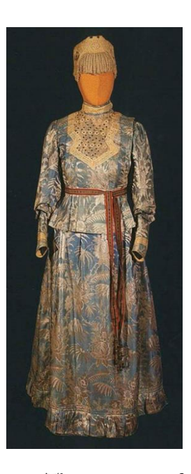
Figure 36. The costume of a young woman 'couple'. The late 19th and early 20th century. Olonets Province, Kargopol County, Arkhangelsk Region. It consists of a jacket and a skirt made of blue silk jacquard fabric