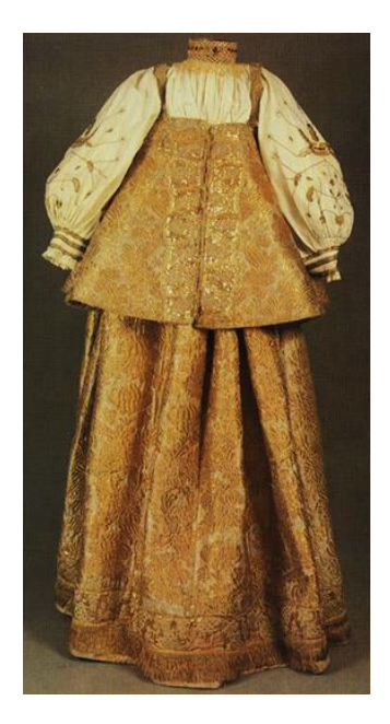
Figure 14. Women's festive costume. The late 19th century. Olonets Province