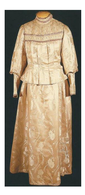
Figure 38. Festive women's costume. The early 20th century. Olonets Province, Kargopol County. It consists of a 'seven-stitches' jacket and skirt, made of silk fabric with a lilac tint