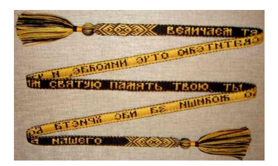
Figure 31. Woven Belt