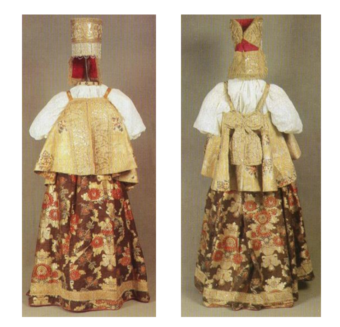
Figure 3. A girl's costume, a). Front view; b). Rear view. The late 19th and the early 20th century. Arkhangelsk Region. Shirt: 'Collar' (shirt), muslin fabric. Skirt: semi-parcha fabric, calico, braid, braid. Dressing: cardboard, silk, braid, metal fringe, foil, artificial pearls, mother of pearl, sewing, knitting