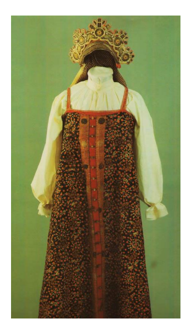
Figure 7. The costume of a young girl of the Arkhangelsk Region. The early 19th century. Shirt: cotton, lace. Sundress: linen canvas, hand-printed, girlish crown: silk, lace, coloured glass, glass beads, artificial pearls