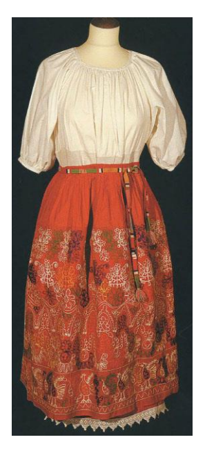
Figure 30. Skirt. The early 20th century. Olonets Province, Kargopol County. It is sewn from five straight strips of red kumach, assembled from above under a belt-strap. The hem is decorated with embroidery in the technique of 'tambour seam'