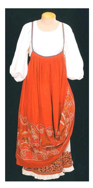
Figure 34. Women's 'sloping suit'. The early 20th century. Olonets Province, Kargopol County. It consists of a shirt 'pokosnitsa' and a sundress. The upper part of the sleeve, made of cotton fabric, calico. The lower part (the mill) is sewn from homespun linen. The hem is decorated with colored embroidery 'tambour'