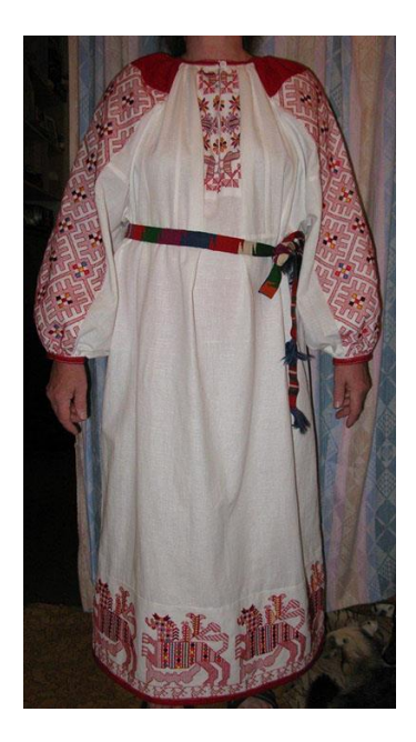
Figure 26. Women's shirt. The early 20th century. Olonets Province, Kargopol County. Olonets sewing