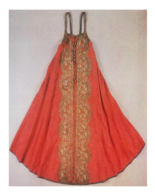
Figure 21. A festive girlish sundress of early 19th century. Olonets Province. Kargopol County. Damask, canvas, krashenina (lining), metal lace and cord, silver buttons with embroidery

Figure 20. A girl's festive costume. The late 19th and the early 20th century. Arkhangelsk Region. 'Collar' (shirt) made of 'muslin' fabric. The skirt is made of half-parchment and calico for lining, braid, braid. Headband (headdress): cardboard, silk, braid, foil, pearls, mother of pearl, sewing, knitting