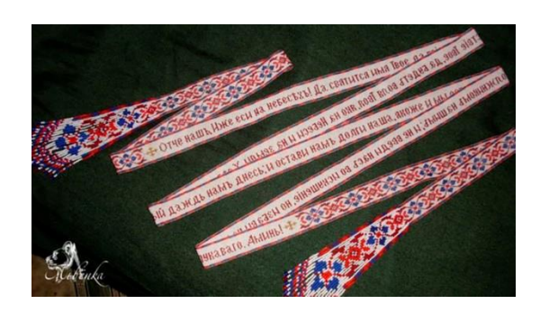
Figure 32. Woven Belt