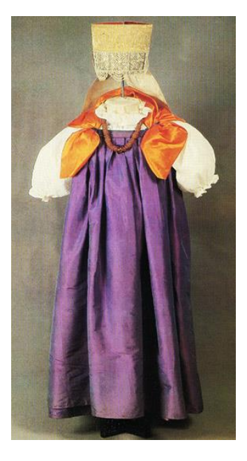
Figure 13. A girl's costume. The late 19th and early 20th century. Arkhangelsk Region