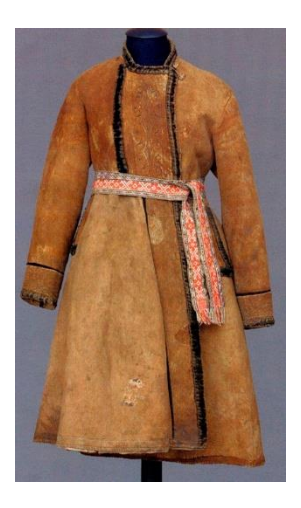
Figure 19. Zipun, i.e., unisexual outerwear. From the 17th to the 20th centuries. Factory cloth, woven belt – sash