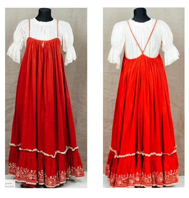
Figure 24. A festive girlish sundress. Medvezhegorsk, Pudozh County. A) Front view. B) Rear view. Kumach fabric, cotton thread, embroidery 'tambour'. The late 19th century.