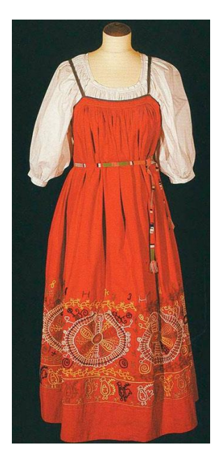
Figure 25. Women's ceremonial costume. The early 20th century. Olonets Province, Kargopol County. It consists of a shirt 'pokosnitsa', a sundress 'kumachnik' and a belt