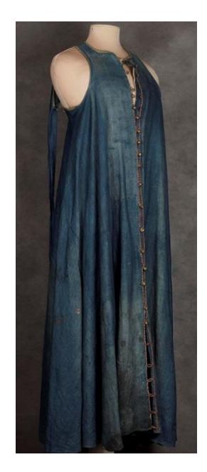
Figure 6. The sundress is an oblique-wedge swing. Petrozavodsk. The late 18th and early 19th century. Linen fabric, copper, silk cord sewing, embroidery bodice and front floors lined with gray canvas