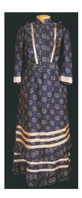
Figure 35. Festive women's costume of the early 20th century. Olonets Province, Kargopol County, Arkhangelsk Region. It consists of a jacket and skirt made of dark blue satin with a white floral pattern