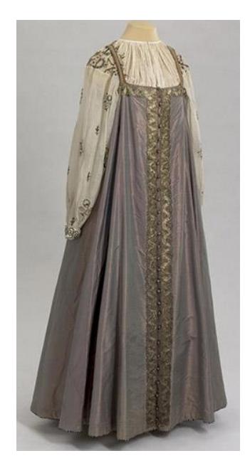
Figure 5. Women's sarafan, Northern provinces of Karelia, the early 19th century. Consists of: silk, linen, metal thread, gold braid