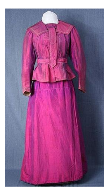
Figure 4. Vepsky women's suit. The late 19th and the early 20th century. Karelia, Sheltozersk Museum. It consists of a jacket and a skirt of cherry-coloured satin