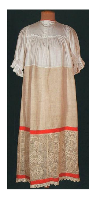
Figure 27. Shirt 'pokosnitsa'. The late 19th and early 20th century. Olonets Province, Kargopol County. It consists of two parts.