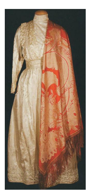
Figure 37. Wedding costume of a peasant woman, 'couple'. The early 20th century. Olonets Province, Kargopol County. It consists of a jacket and skirt, pale turquoise silk 'shtof'