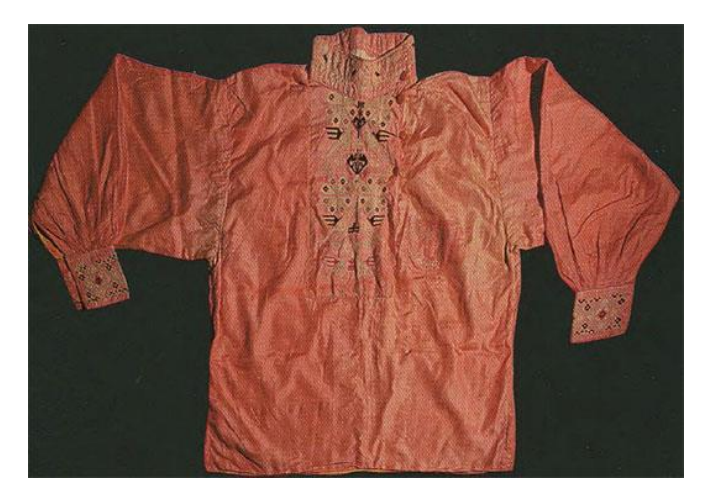
Figure 17. Men's festive shirt. The late 19th and early 20th century. Arkhangelsk Region, Pinezh County