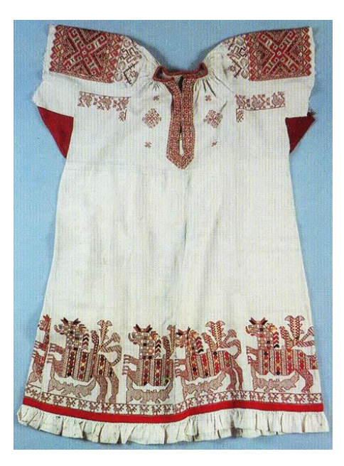
Figure 22. A girl's costume. The late 19th and early 20th century. Arkhangelsk Region. The late 19th century. Olonets Province