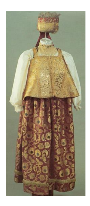
Figure 20. A girl's festive costume. The late 19th and the early 20th century. Arkhangelsk Region. 'Collar' (shirt) made of 'muslin' fabric. The skirt is made of half-parchment and calico for lining, braid, braid. Headband (headdress): cardboard, silk, braid, foil, pearls, mother of pearl, sewing, knitting