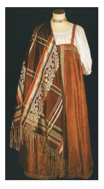
Figure 9. Festive girl's costume: 'Sleeves' – shirt: calico fabric. The sundress is oblique-wedge and swinging: the fabric is silk taffeta. The late 19th century. Olonets Province, Kargopol County