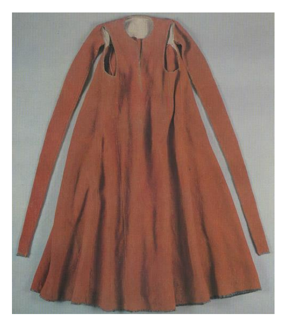
Figure 15. Feryaz. The early 19th century. Women's outerwear such as a sundress made of red, blue canvas, cloth or silk