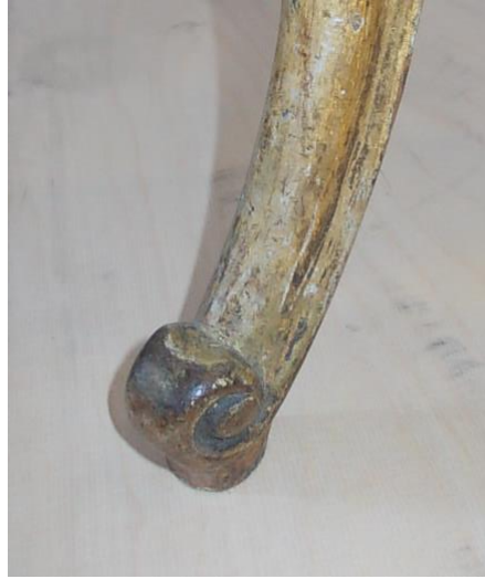
Figures 12-13. Fragments of chair legs with loss of soil with finishing and heavy dirt