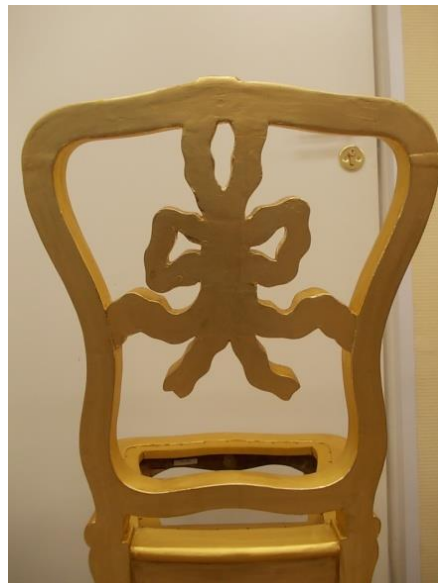
Figures 45-46. A fragment of the back side of the chair back in the process of restoration after removing persistent surface dirt and making up for local losses of the ground-levkas; in the process of recreating the imitation of gilding with Dutch metal