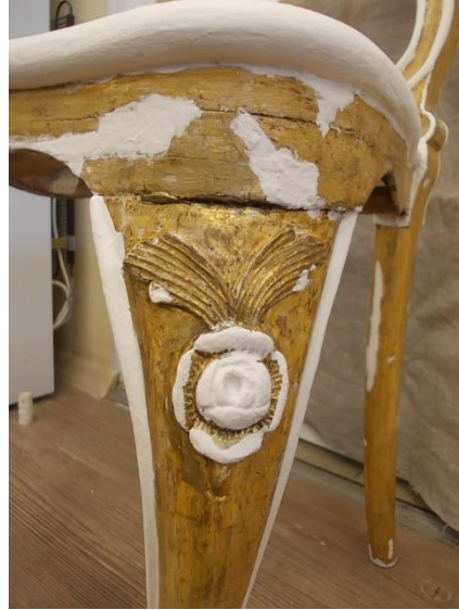
Figures 23-24. A fragment of a chair (top of the right leg) before restoration and after removal of uneven reddened shellac varnish and local replenishment of the loss of levkas