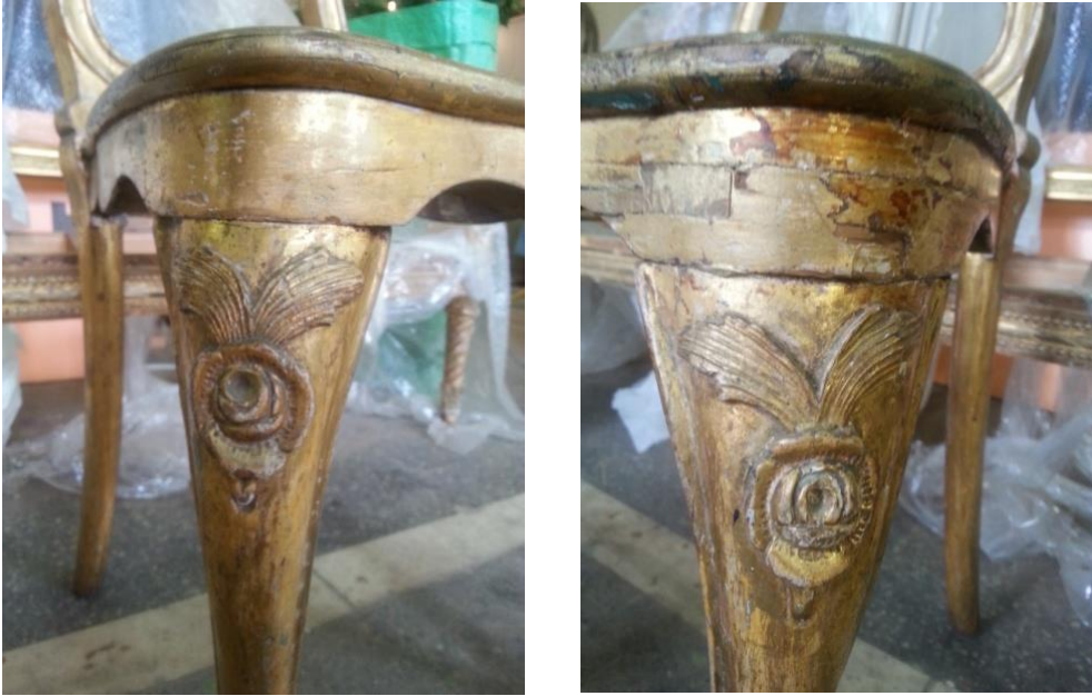
Figures 5-6. Fragments of the front side of the chair (upper parts of the left and right legs) before the restoration