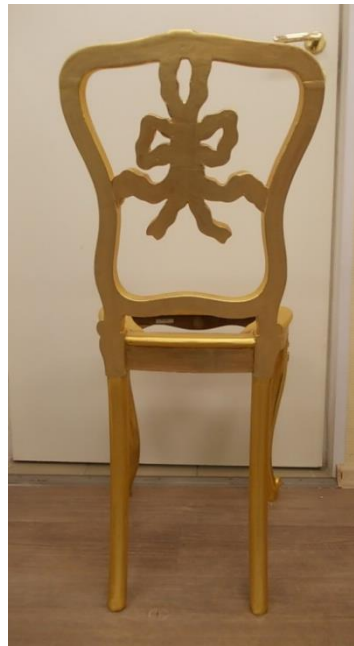
Figures 49-50. The back side of the chair before and after performing a complex of restoration works