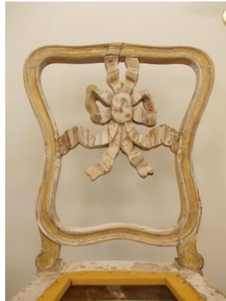
Figures 31-32. A fragment of a chair (front side of the back) in the process of restoration after clearing of late layers and persistent surface dirt