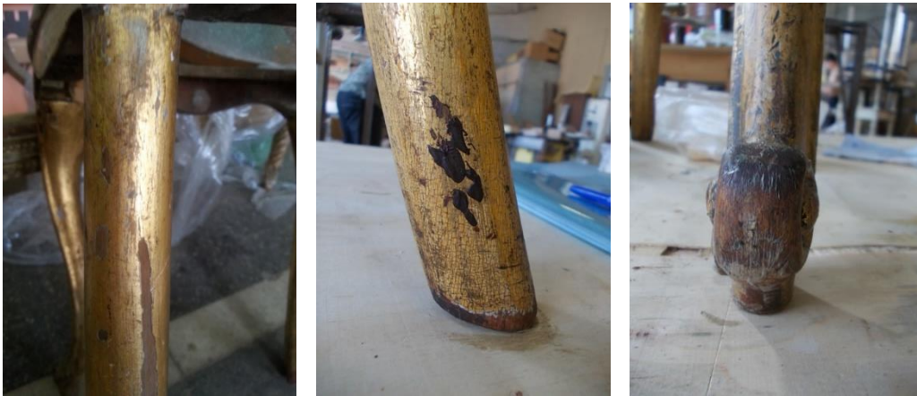
Figures 9-11. Fragments of chair legs with loss of soil with finishing and heavy persistent dirt