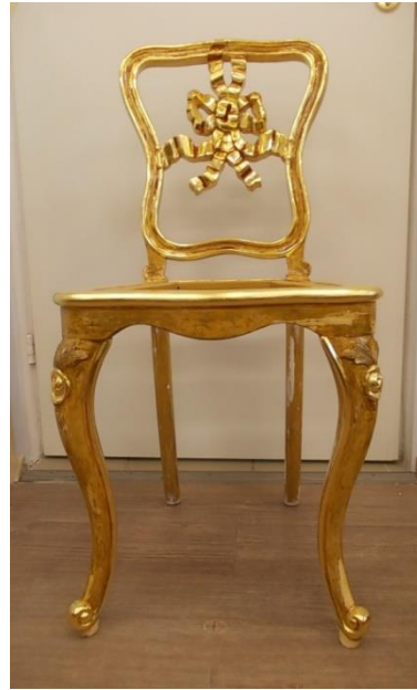
Figures 16-17. General view of the front side of the chair in the process of restoration – application of primer-poliment and in the process of gilding on the poliment