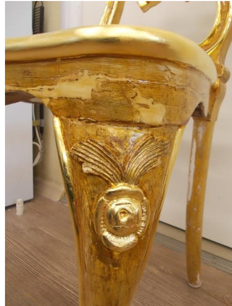
Figures 25-26. A fragment of a chair (the top of the right leg) in the process of glossy gilding on the flower and rollers and applying shellac varnish on the recreated levkas before matte gilding