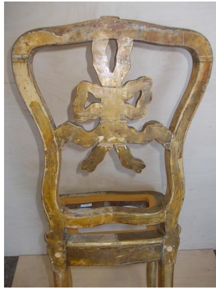
Figures 43-44. A fragment of the back of the chair back before restoration, in the process of removing persistent surface dirt