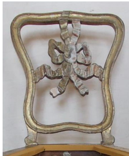
Figures 29-30. A fragment of the chair (front side of the back) before restoration and in the half-clearing of late layers and persistent surface dirt