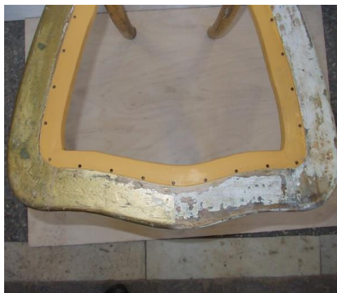
Figures 37-38. A fragment of a chair (seat) before restoration with solid bronze paintwork and half-clearing of late bronze paintwork with revealed loss of ground-levkas