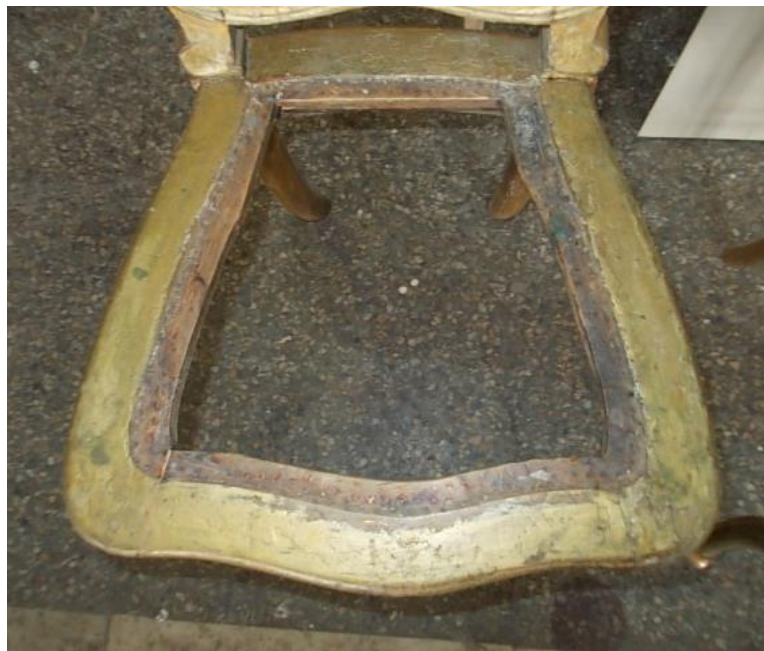
Figure 7. Fragment of the front side of the chair (seat) before restoration with strong solid late bronze paintwork