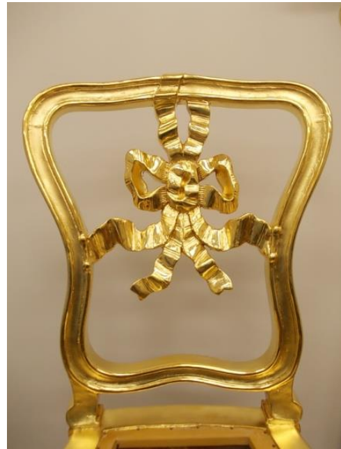
Figures 35-36. A fragment of a chair (front side of the back) in the process of restoration after filling in the local gilding of the back cushions and the bow on the poliment. Matte gilding of the background areas of the chair back on spoons