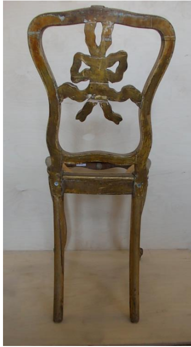
Figure 8. The back of the chair (back) before restoration