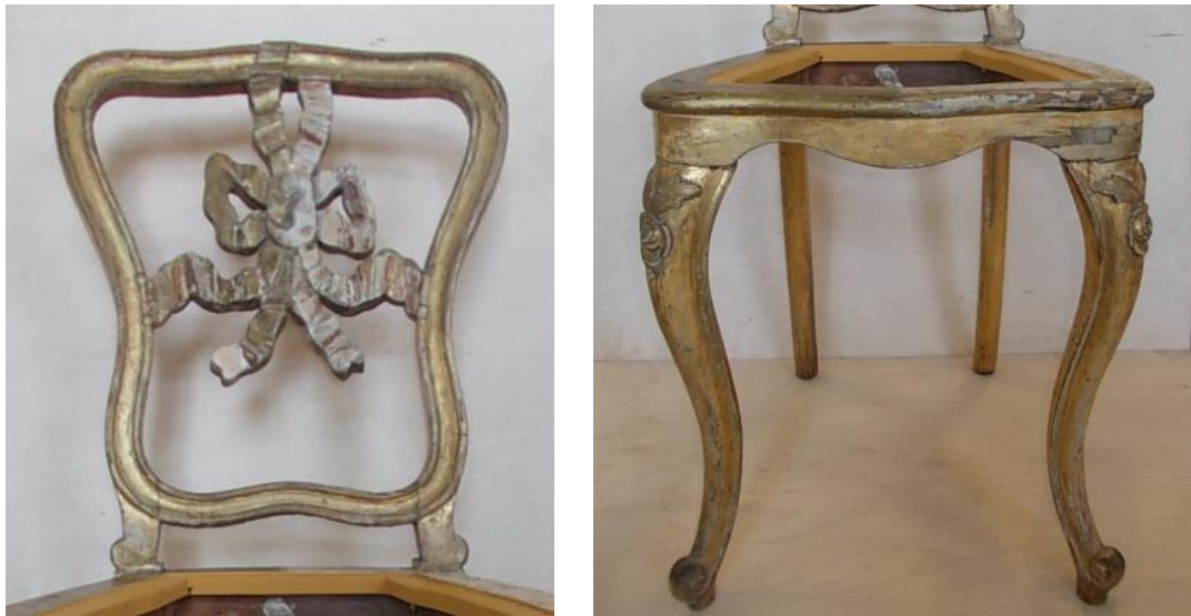
Figures 3-4. Fragments of the front side of the chair (back, frame, and legs) in the process of half-clearing of late layers and persistent surface dirt