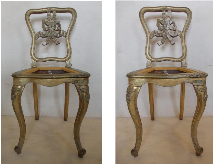
Figures 1-2. General view of the front side of the table before restoration in the process of half-clearing of late layers and persistent surface dirt