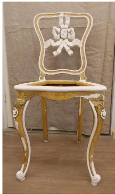
Figures 14-15. General view of the front side of the chair in the process of restoration after clearing of late layers and local reconstruction of the loss of soil-levkas