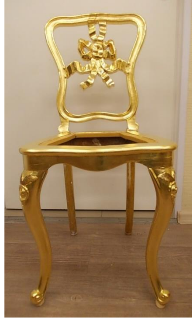
Figures 47-48. The front side of the chair before and after performing a complex of restoration works