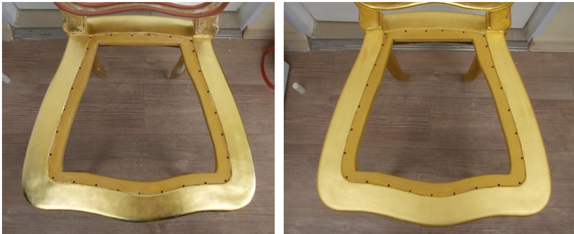
Figures 41-42. A fragment of a chair (seat) in the process of restoration: matt gilding on the codpiece and the process of tinting matt gilding