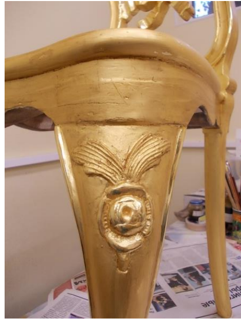
Figures 27-28. A fragment of a chair – the top of the right leg after performing local glossy and matte gilding and applying a matte toning composition to the areas of matte gilding