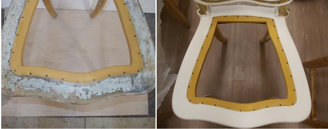
Figures 39-40. A fragment of a chair-seat in the process of restoration-after the removal of solid bronze paintwork with the loss of the ground-levkas