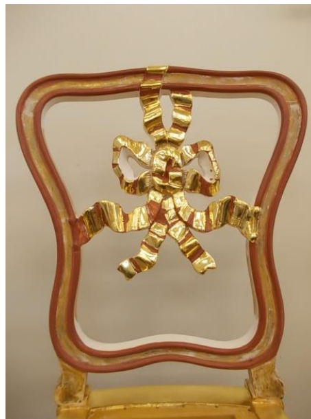
Figures 33-34. A fragment of a chair (front side of the back) in the process of restoration after making up for local losses of the levkas, applying a primer-poliment on the outer perimeter of the back and performing gilding on the poliment on the fragment of bow