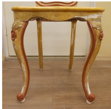
Figures 21-22. Fragments of the front side of the chair (frame and legs) in the process of local replenishment of the loss of levkas and the application of the poliment to perform glossy gilding on the poliment