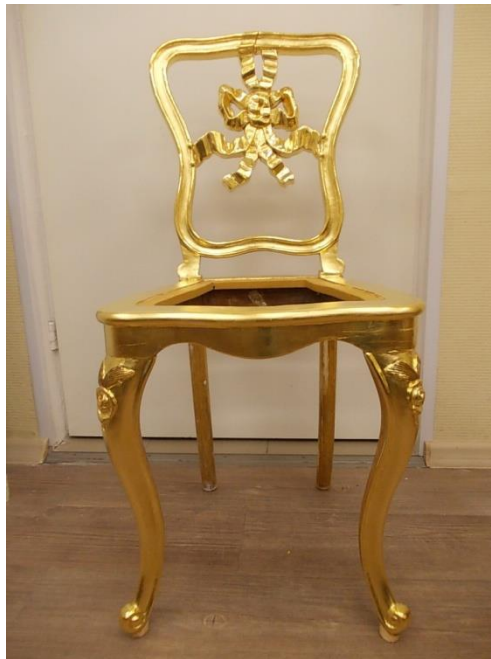
Figure 18. General view of the front side of the chair after performing all types of gilding