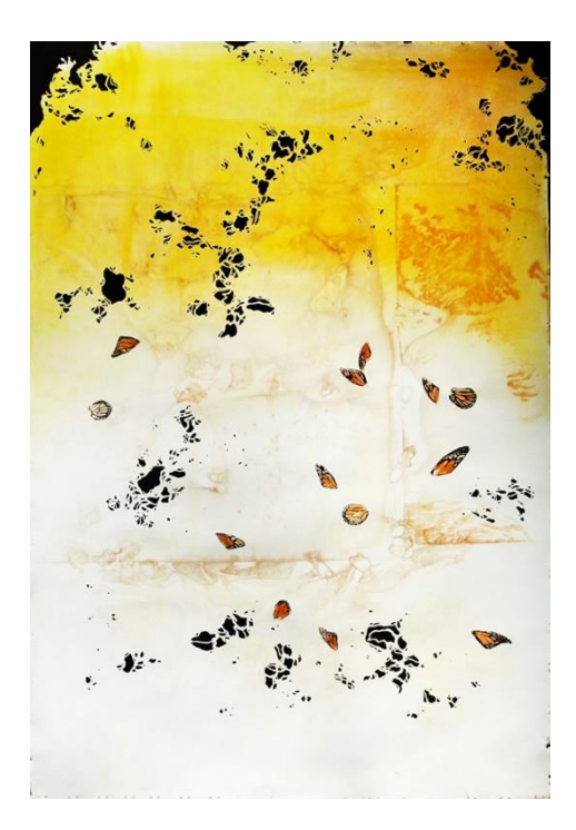
Figure 5. Laura Duduleanu, In the Aftermath of Love, watercolor, paper impression, papercutting. Private collection