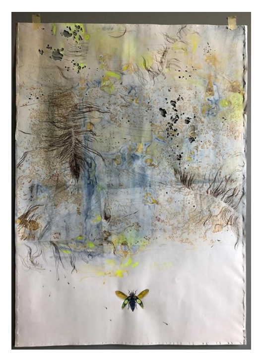
Figure 4. Laura Duduleanu, Chasing Memories, watercolor, papercutting, paper impression. Personal collection