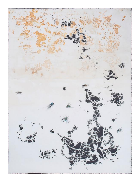
Figure 3. Laura Duduleanu, Fly-Away, papercutting, paper impression, watercolor. Personal collection