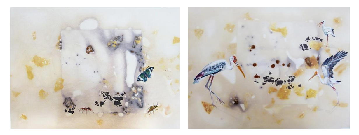
Figure 1. Laura Duduleanu, Illustration, watercolor, paper cutting, paper impression. Private collection