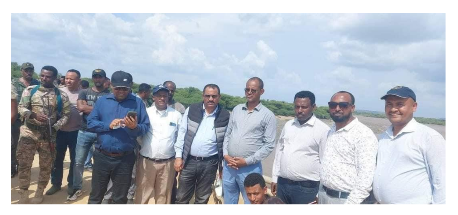
Fig. 3. Officials of Gondar, Bahir Dar (BDU), Debre Markos, Debre Birhan, Debre Tabor, Wollo, Woldiya and Debarq Universities on the Tekeze bridge in Humera<sup>111</sup>. They were on an organised visit to the armed forces in the occupied Western Tigray. The same officials have never visited their own university colleagues who are in concentration camps in Amhara Region. There is also no evidence that in Humera, they inquired about the dire human rights infringements in that town.