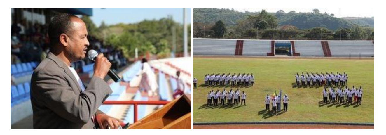
Fig. 1. BDU president opens the graduation ceremony of the second basic military training course for its administrative and academic staff. The original post on the university's Facebook page has been deleted, but the archive has been conserved<sup>109</sup>.