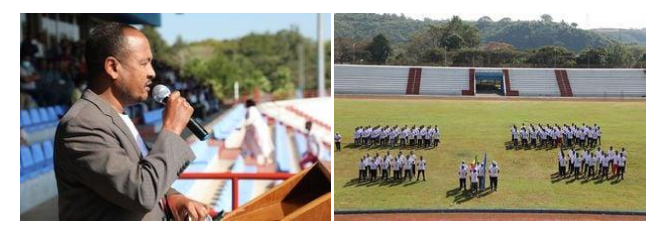
Fig. 1. BDU president opens the graduation ceremony of the second basic military training course for its administrative and academic staff. The original post on the university's Facebook page has been deleted, but the archive has been conserved<sup>109</sup>.