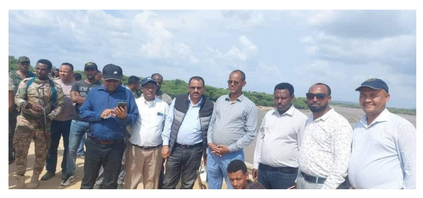
Fig. 3. Officials of Gondar, Bahir Dar (BDU), Debre Markos, Debre Birhan, Debre Tabor, Wollo, Woldiya and Debarq Universities on the Tekeze bridge in Humera<sup>111</sup>. They were on an organised visit to the armed forces in the occupied Western Tigray. The same officials have never visited their own university colleagues who are in concentration camps in Amhara Region. There is also no evidence that in Humera, they inquired about the dire human rights infringements in that town.