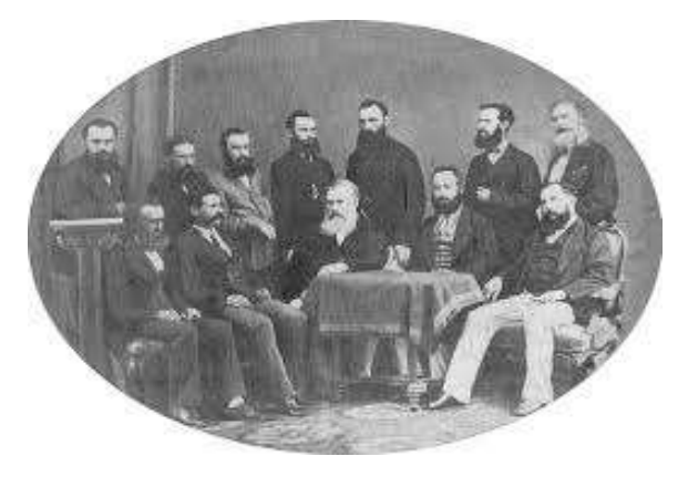
Fig. 4: First batch of geologist employed by GSI