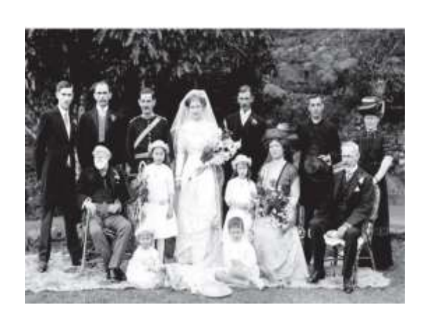
Fig. 5: Foot with his extended family