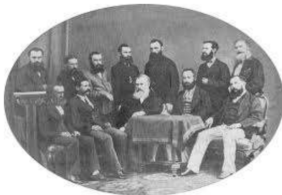
Fig. 4: First batch of geologist employed by GSI