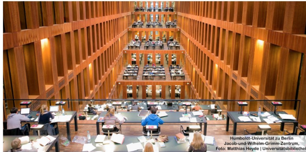
Humboldt-Universität zu Berlin Jacob-und-Wilhelm-Grimm-Zentrum