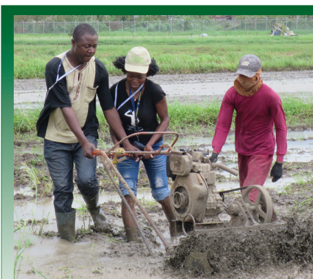
Under the JICA-Africa Training Program, the final of 9 courses offered over 4 years focused on rice production and research techniques for African research technicians with 15 participants from Benin, Burkina Faso, Congo, Côte d'Ivoire, Guinea, Kenya, Mali, Tanzania, and Togo.

(11 males, 8 females) for students from Bangladesh, India, Indonesia, Myanmar, Nepal, Philippines, Thailand, and Vietnam.