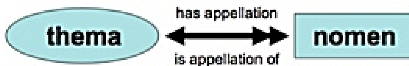
Figure 3: Thema-nomen relationship in controlled vocabularies

In general, (i.e. in natural languages or when mapping different vocabularies), the has appellation/is appellation of relationship is a many-to-many relationship. A thema has one or more nomen and there may be more than one thema referred to by the same nomen. However, in controlled vocabularies and within a domain, a nomen normally is an appellation of only ONE thema, as illustrated in Figure 3. (The attributes identified for nomen are not included in this discussion.)