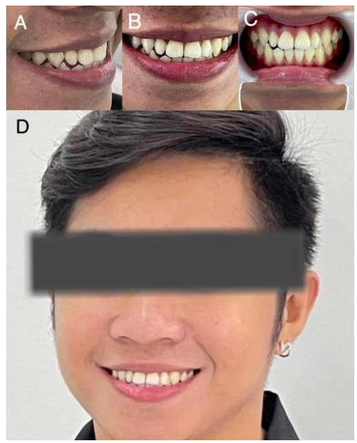
Figure 1. Pre-Op photos indicating A) Right smile profile of patient B) Front smile profile of patient C) Frontal view of the retracted mouth of the patient showing maxillary and mandibular teeth D) Smile profile of the patient

A 26-year-old male patient presented to the clinic with a chief complaint of his edge-to-edge bite and unaesthetic forms and sizes on his upper and lower anterior teeth. He was selfconscious about his appearance and wanted his teeth to look and feel natural (figure 1).