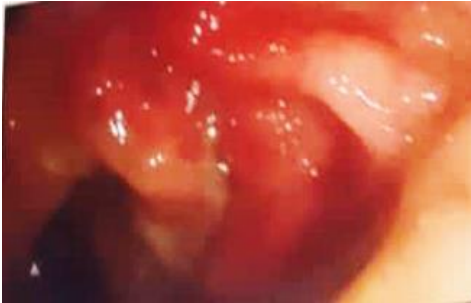
Figure 2:- Colonoscopy of the rectum showed edematous, erythema, mucosal friability, and erosions noted in the rectal area.

Real-time abdominal ultrasonography scanning revealed normal liver, gall bladder, spleen, pancreas, and kidneys with no ascites. Colonoscopy of the rectum showed edematous, erythema, mucosal friability, and erosions noted in the rectal area (Figure 2). The rest of the colon was normal. A colonoscopic biopsy was done. Macroscopically the colonoscopic biopsy showed to consist of multiple soft tiny tan-grayish pieces of tissue measuring in aggregate 0.6x0.6 cm (Figure 3). Microscopically the colonoscopic biopsy showed active colitis with eosinophilia. There was no evidence of granuloma formation, cryptitis, or crypt abscess. There was no dysplasia and malignancy within the limits of the specimen (Figure 4).