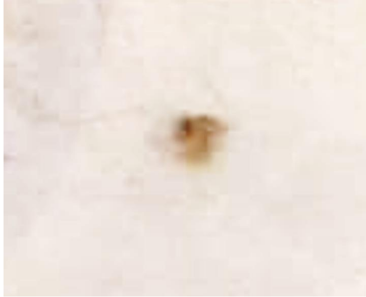
Figure 3:- Colonoscopic biopsy macroscopically showed to consist of multiple soft tiny tan-grayish pieces of tissue measuring in aggregate 0.6x0.6 cm.