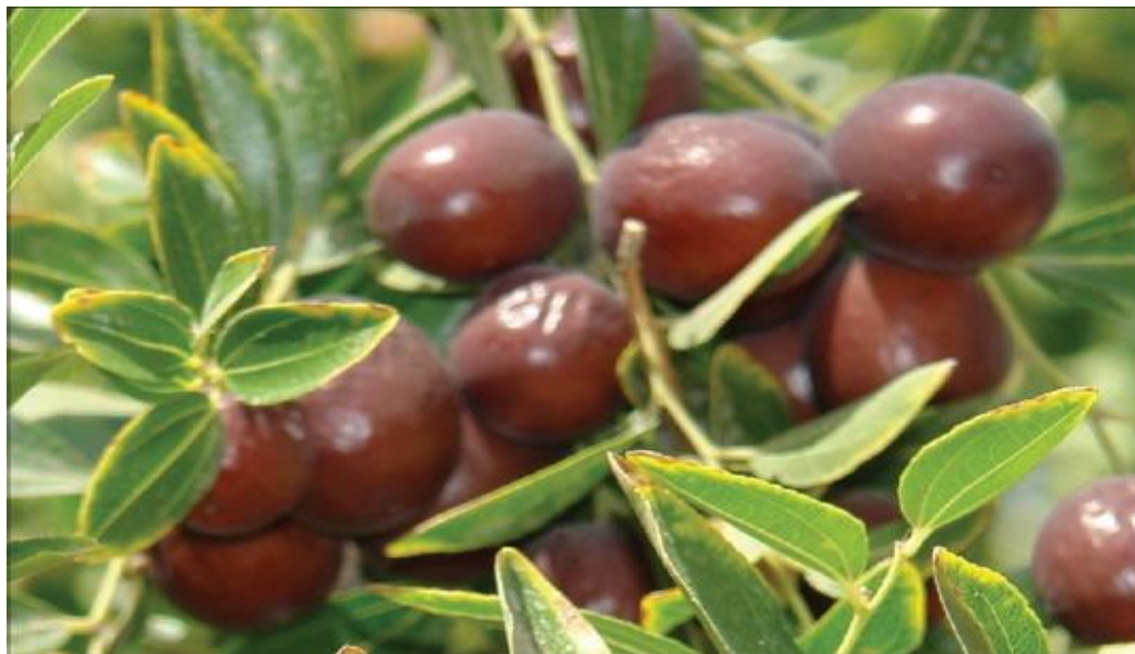
Fig 1: Fruits of Ziziphus jujube .

INTRODUCTION The practice of application of medicinal plants for relief from many illnesses dates back to ancient times. 1 Ziziphus jujuba Mill., ( Z. jujuba ) or the jujube, a herbal plant used in traditional medicine, belongs to the Rhamnaceae family and is one of the most important Ziziphus species. 2 In terms of geographical distribution, Z. jujuba is widely located in the tropical and subtropical regions of Asia and America as well as in the Mediterranean regions. 3 The mature fruit of Z. jujuba are red to purplish black in color, resembling small dates, and in China are known as the date or red date. The dried fruit of Z. jujuba is known in Persian cuisine as “annab.” Jujube trees grow in the arid and semiarid zones of Iran, especially in Birjand, South Khorasan province 4 Because of the plant's extensive utilization in food and pharmaceutical industries, production has increased sharply over the past decade. China has been the site of 90% of Z. jujuba production in the world, as it is indigenous to China with a history of over 4,000 years 5-6