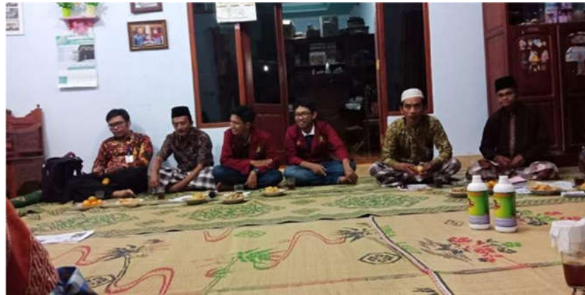
Fig. 6. Extension of Brand Logo and Product Packaging in the Form of Bottles for POC

outreach activities was carried out at the house of the Head of Hamlet who is also the Head of the Farmer's Group in Kadigunung Hamlet as shown in Figure 6 which was attended by all farmer groups, both the Makmur Farmers' Forest Group (Poktan) and the Sedyorukun Women's Farmer Group.