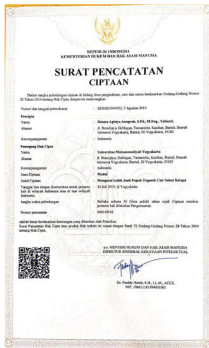
Fig. 7. Copyright of POC Module

Then the servants help the citizens to register the trademark of POC products and register the copyright of the POC Module with the Directorate General of Intellectual Property Rights as shown in Figure 7. The figure shows that trademark registration is useful as intellectual property protection for micro, small and medium enterprises (MSMEs). And for the registration of Copyright Modules, it is intended that module products created by the academic community of the University of Muhammadiyah Yogyakarta can be protected and belong to the university as one of the ranking items and are also useful for inventors, especially the chairman and community service team and can be freely used by residents of Dusun Kadigunung because this is one of the grants to the community in this service program.