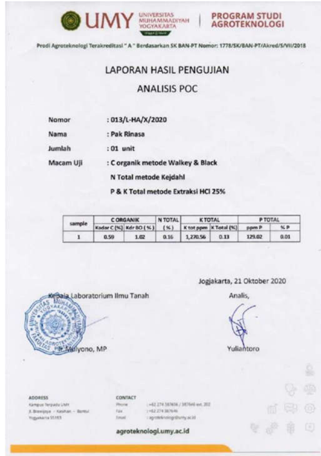
Fig. 4. Results of Resident-Made POC Analysis Test

After testing in the laboratory, testing the POC application made by residents on chili plants is shown in Figure 5. The picture shows that this test aims to determine the ability of POC in carrying out its function as fertilizer. The result is that the chili plants that have been watered with POC made by local residents have dense fruit and the leaves are not curly.