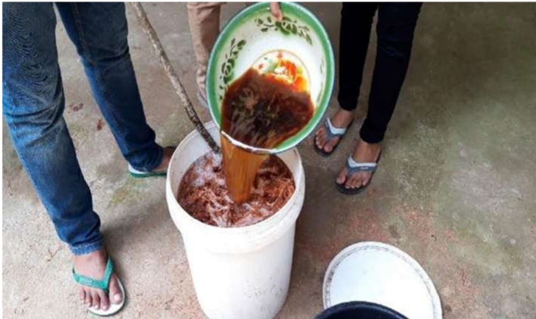
Fig. 3. POC Making Process Training for the Community

Servants carry out training on making POC at the stage of fermentation of chopped coconut fibers and knowledge extension in the world of agriculture can be seen in Figure 3. The figure shows that this counseling also explains knowledge in the world of agriculture, especially on the importance of fertilizers, nutrient content, and water in soil and giving it to plants.