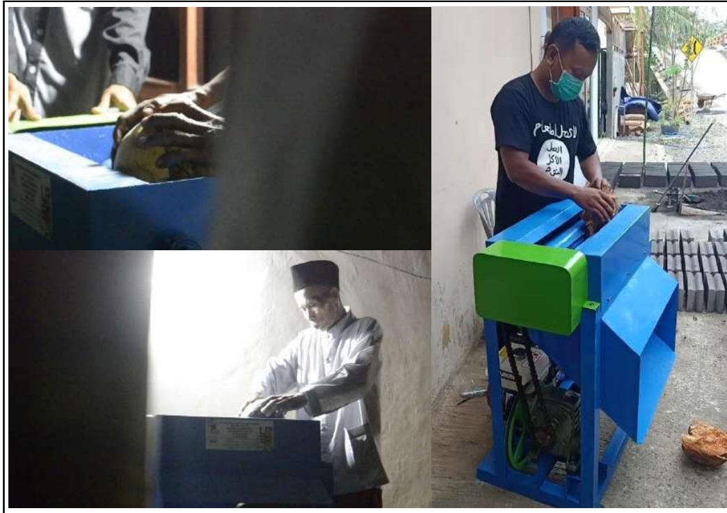
Fig. 2. Coconut Coir Counting Process with Coconut Coir Chopping Machine by Partners

Servants carry out training on making POC at the stage of fermentation of chopped coconut fibers and knowledge extension in the world of agriculture can be seen in Figure 3. The figure shows that this counseling also explains knowledge in the world of agriculture, especially on the importance of fertilizers, nutrient content, and water in soil and giving it to plants.