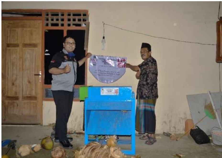
Fig. 1. Grant of Coconut Coir Peeler Machine

The servants together with the residents of Dusun Kadigunung collect coconut coir waste. Every resident who owns coconut land is asked to collect coconuts at the house of the head of the hamlet who is also the head of the Kadigunung farmer group. Then the implementation of the grant of Appropriate Technology Products in the form of Coconut Coir Peeling Machines to the people of Dusun Kadigunung as shown in Figure 1. The figure shows that the grants were represented by the Head of the Farmers Group as well as the Head of Hamlet of Kadigunung Hamlet.