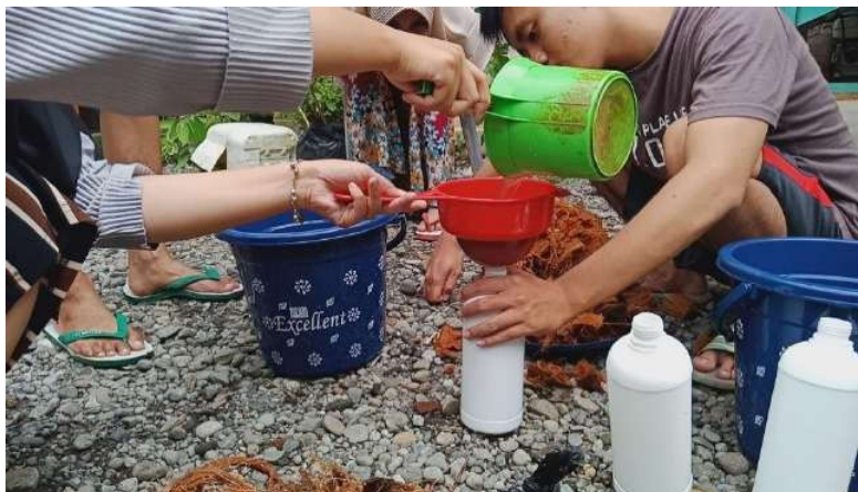
Fig. 8. The Finished POC Results are Put in Bottle Packaging For Labeling

manufacture and packaging of POCs. The inclusion of POC in bottles that have been socialized can be seen in Figure 8.