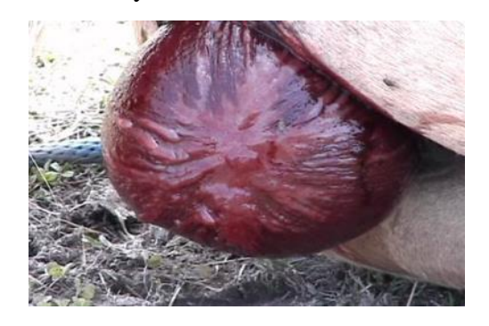
b) 'Red bag' delivery (appearance of cervical star)

influence abnormal detachment of placenta include: a) Placentitis due to bacterial or viral infections; b) Extended labor duration with dystocia and dead foal; c) Fescue toxicity resulting from digestion of grass infested with an endophytic fungus, Acremonium coenophialu (Cross, 2011); d) stress