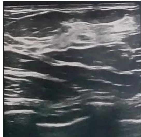
Fig 2: Breast ultrasound

On echomammography: appearance of galactophore involvement by heterogeneous tissue proliferation accompanied by an axillary adenopathy. This appearance is highly suspicious and classified as ACR 4.