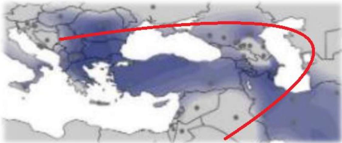
Figure 1. The sketched approximate southern Arc (Greece-Balkans-Black Sea-Anatolia-Caucasus-Armenia-Levant)

In this arc, various ancient human civilizations formed and spread. These civilizations, which have either been lost to history or have survived to this day, are not only the legacy of the inhabitants of the present-day region they left behind but have had a profound effect on human civilization as a whole.