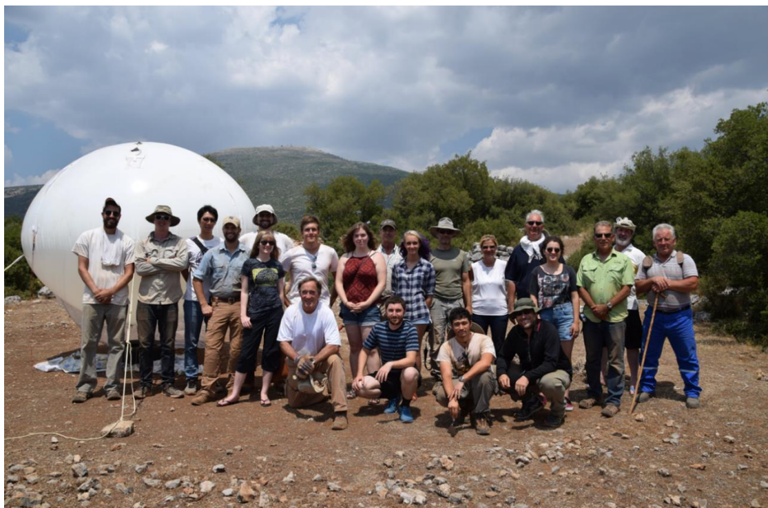
Figure 8. The first team in 2016 (colleagues, students, workers) besides the helium balloon for aerial photos.