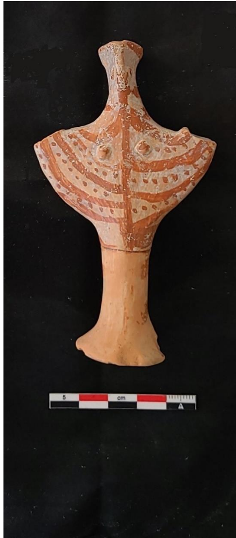
Figure 5. Figurine Psi tomb A, locus 121, sq.6/19, 2016 (K109) (see Fig 20 Sideris, A., I. Liritzis, B. Liss, M.D. Howland, T.E. Levy (2017). At-risk cultural heritage: new excavations and finds from the Mycenaean site of Kastrouli, Phokis, Greece. Mediterranean Archaeology and Archaeometry 17 (1), pp. 271-285; Bratitsi M., I. Liritzis, A. Vafiadou, V. Xanthopoulou, E. Palamara, I. Iliopoulos, N. Zacharias (2018). Critical assessment of chromatic index in archaeological ceramics by Munsell and RGB: novel contribution to characterization and provenance studies. Mediterranean Archaeology & Archaeometry 18(2), pp. 175-212 (DOI: 10.5281/zenodo.1297163).