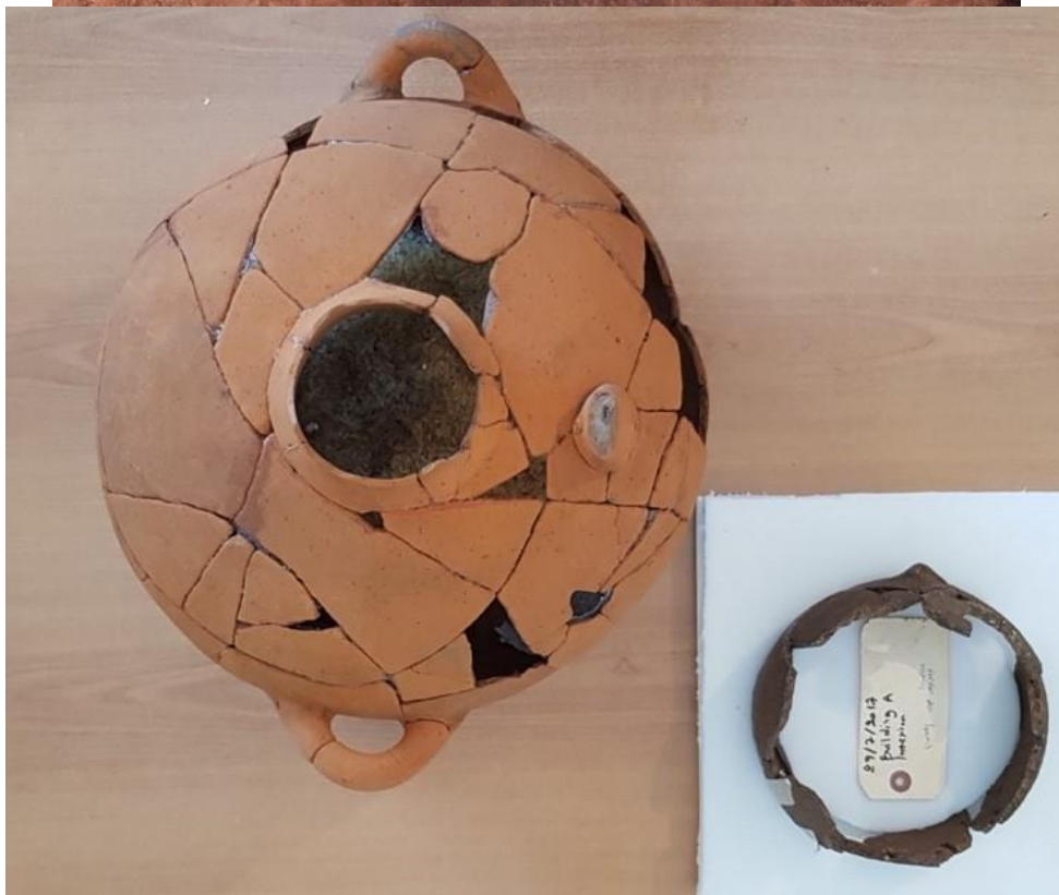
Figure 6. UP: The hydria & the oenochoe during the excavation of Building 1, 2017. LOWER: The objects after the first maintenance (conservation-restoration) work (under the supervision of Dr P. Manti, Ionion University, Greece).