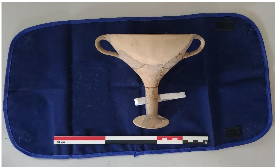
Figure 4. The high stemmed conical kylix from Building 1 restored. (see, Sideris 2022).