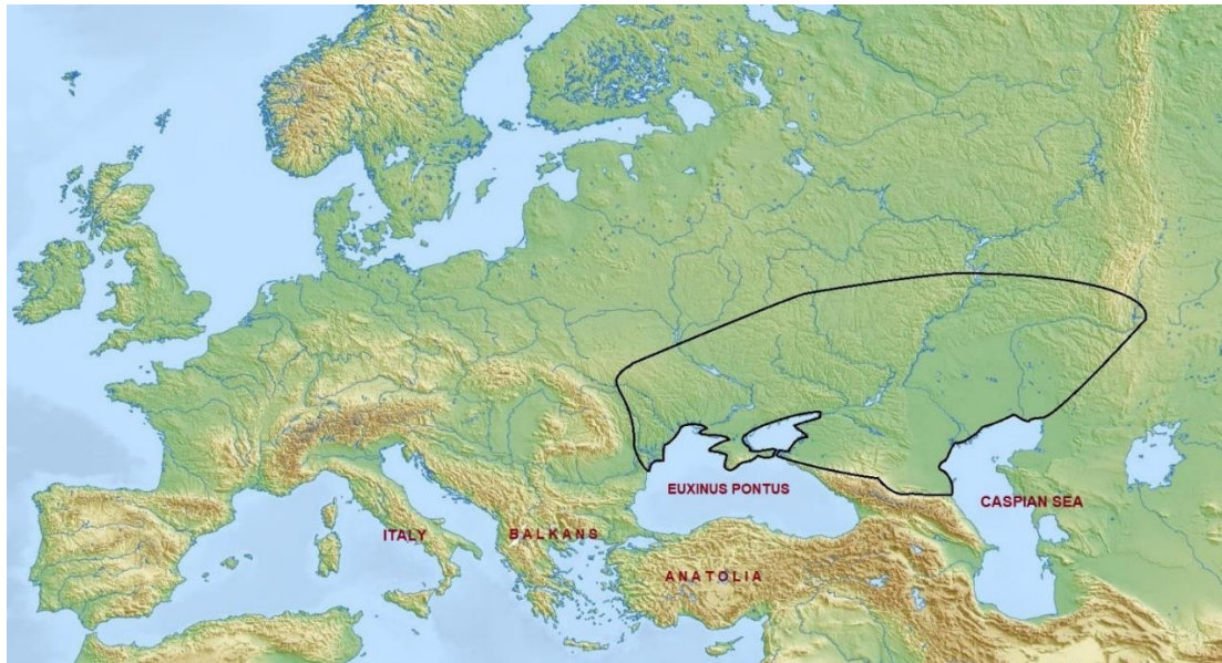
Figure 2. Map of the Yamnaya culture, based on map printed at page 651 in Encyclopedia of Indo-European Culture, which was edited by J. P. Mallory and Douglas Q. Adams, and published by Taylor & Francis in 1997. Created: 31 October 2021 (CC BY-SA 4.0)

No steppe connection can be established for the speakers of the Anatolian languages due to the absence of an eastern origin of hunter-gatherers in Anatolia, in contrast to all other areas where Indo-European languages were spoken.