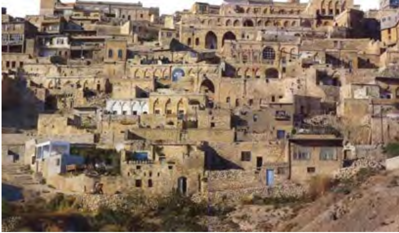
Figure 1. A settlement shaped by the influence of different elements and having an identity, Mardin/Turkey (Kılıç, 2010).

When we examine the relation between conservation and sustainability of materials used in construction, it can be seen that these concepts can not be considered separately from each other. It is possible to say that traditional structural materials have great importance in the context of sustainability when it is considered that sustainability is the approach that has the least harm to the environment and conservation of resources with today's approach. In this context, the basis of sustainability is in the past; in conjunction with which conventional material is in use (Slessor, 2002). User comfort, thermal, visual and acoustic comfort, outdoor visual communication, clean air and user-specific measures to ensure sustainability in building design have been achieved through the use of traditional materials. When traditional settlements and the materials that make up these settlements are considered in the context of conservation, it can be considered as an approach which makes it possible that use the specific building materials with specific techniques, to protect the structures and to transfer them to future generations. However, in order to ensure full protection, it has a big importance that maintain the buildings constructed with such materials and to use them in a way that is not contrary to the nature of these materials. In this sense, material is one of the main factors of sustainability.