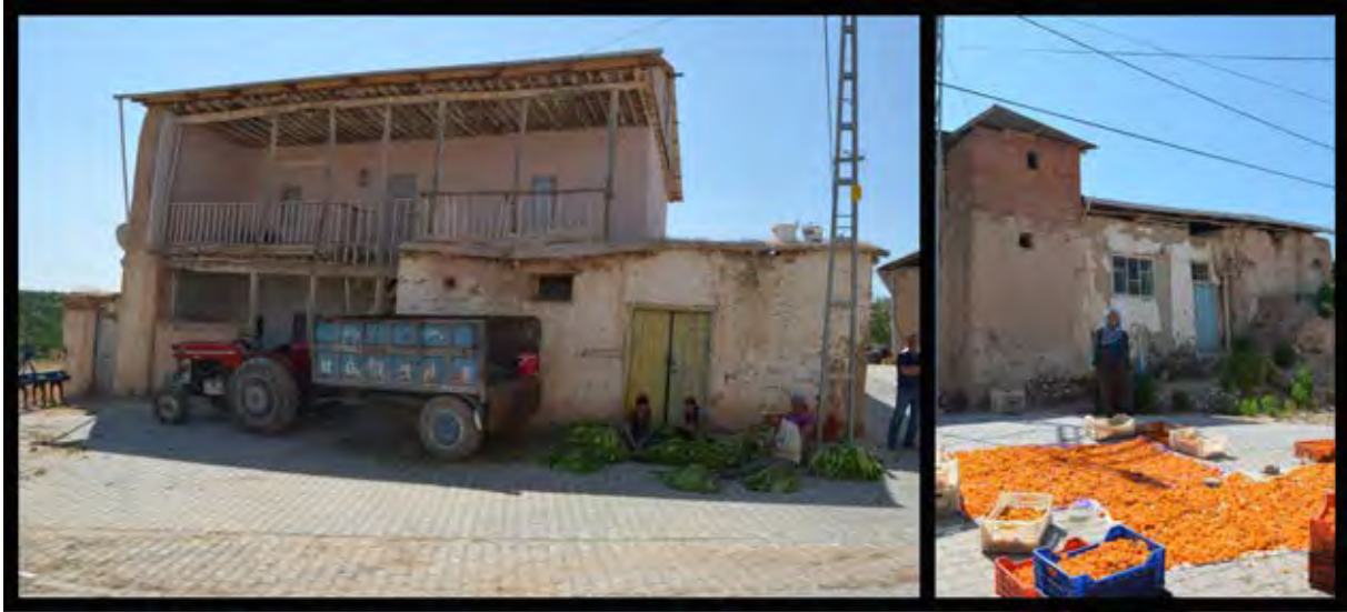
Figure 10. Some of agricultural livelihoods and their relationship with houses and streets, Malatya/Turkey

most common (Özyılmaz & Aluçlu, 2009). All these features directly affect protection and sustainability in the traditional rural adobe settlements