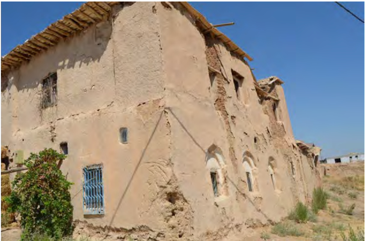
Figure 6. Adobe house that was built by the pilling technique, Malatya/Turkey.