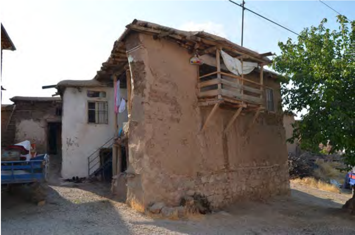
Figure 7. Anadobe house that was built with adobewalls on stone walls, Malatya/Turkey.