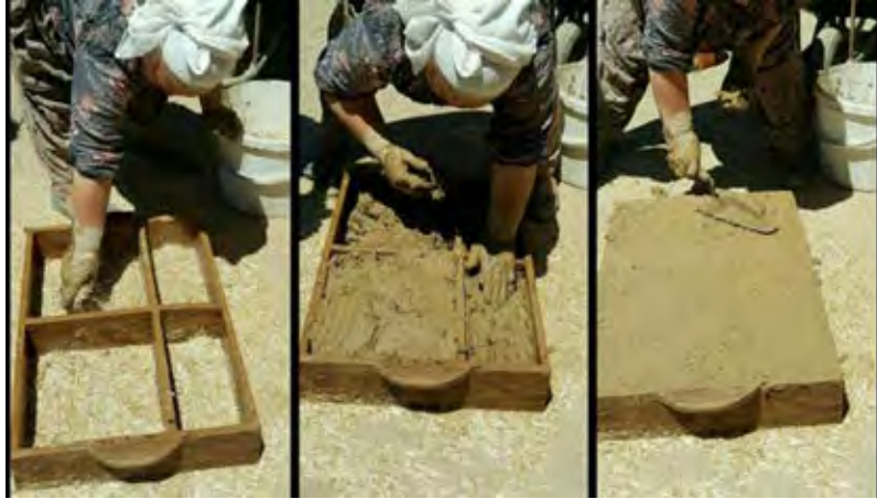
Figure 2. Adobemix in the wooden mold, Konya/Turkey (Duran, 2016).

(Fig. 2). As it is understood from the definition, there are various processes to make adobe which include making it a mixture, drying it and using it as building material. From here, factors that cause the use of adobe material can be listed as economical, climatic, functional, traditional and technological factors (Çelebi, 2012).