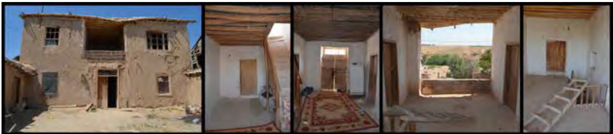
Figure 8. Anadobe house with its with its spatial arrangement, Malatya/Turkey.