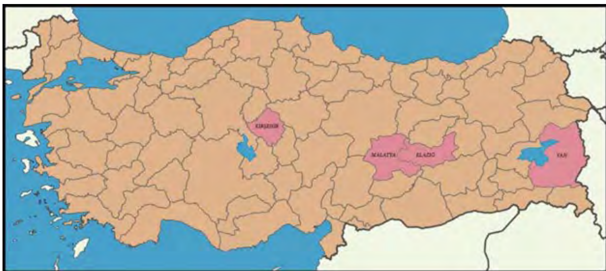
Figure 3. The Anatolian cities where the rural adobe settlements are most prevalent in Turkey.

It is possible to find many examples of the traditional settlement which is built with adobe material and these buildings, in most of the rural settlements in Anatolia today in Turkey. In this sense, Anatolian cities which are most common in traditional rural adobe settlements can be listed as Kırşehir, Van, Elazığ and Malatya in general (Çelebi, 2012) (Fig. 3).