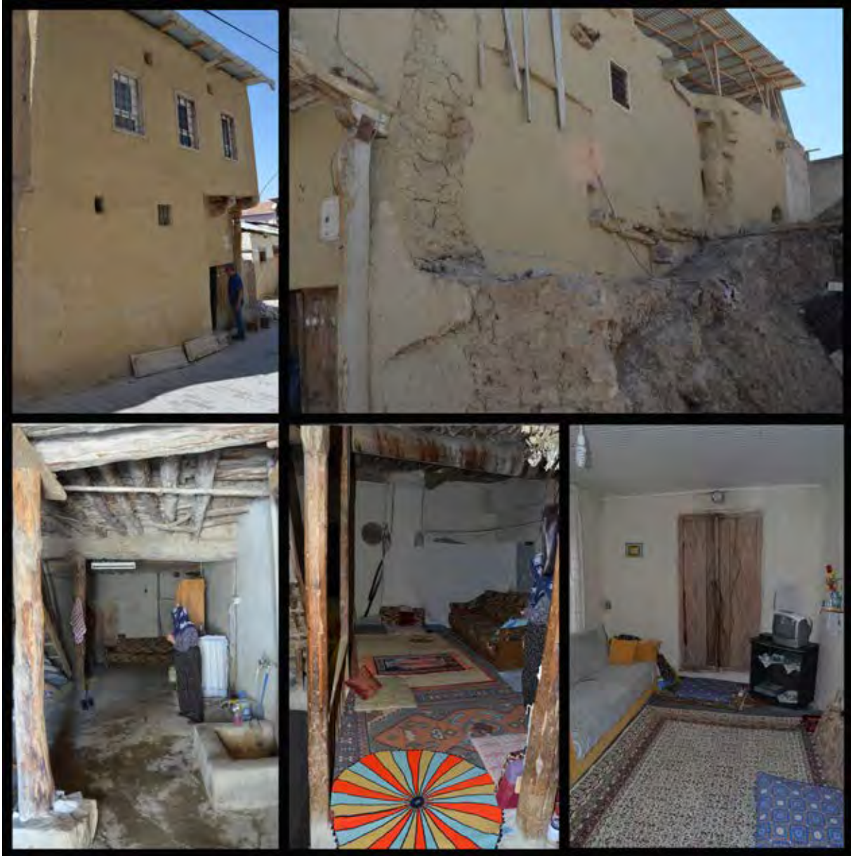
Figure 11. Adobe house which is used by only an old user, Malatya/Turkey

are located in some of these settlements, have been restored and continued to be used. However, in general, it is understood that it is increasingly difficult to protect traditional rural adobe settlements with the influence of socio-cultural and economic reasons.