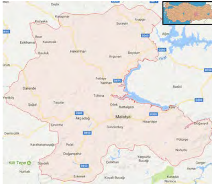
Figure 4. City of Malatya (GoogleMap, 2017)

of the most important cities preferred for settlement throughout the history, due to its location in a locality where topographical features are favorable and many vital resources are available (Fig. 4). In the historical process, the settlement area of the city, which has been plundered and burned down many times, has been moved; today, the old settlement areas of the city are far from the central settlement area.