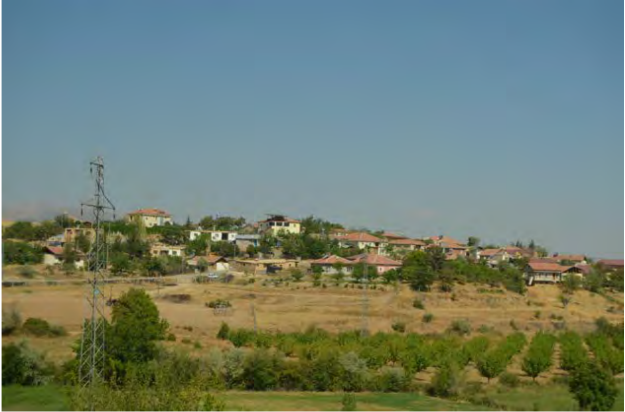
Figure 5. A partially preserved traditional rural settlement, Malatya/Turkey.