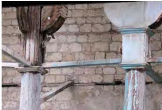
Figure 7. (a): image showing the wooden posts condition inside the men's cold