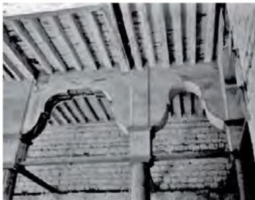
Figure 5. (a) : image showing the arches inside the men's cold bath