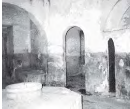
Figure 12. (a): shows the octogonal central fountain in the women's warm room