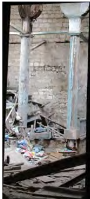
Figure 10. (a): Showing the amount of trash and the mess in the current situation