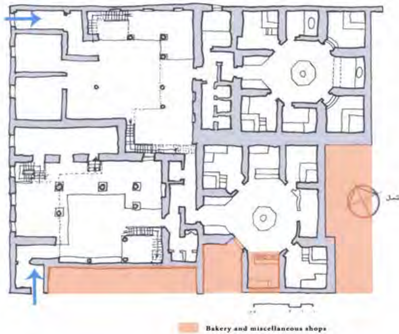
Figure 3. (b) Shows the existing spaces usage of Hammam El Masry