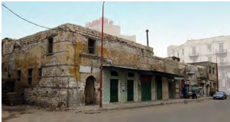
Figure 1. A panoramic view for Hammam El Masry taken from the main street of Escal Elghelal in Mina El-Basal