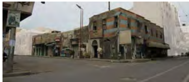
Figure 14. image showing the services condition and the streets around the building

The active participation of the local society is an important process that can lead to the success of any proposed action for the historical building. Hence, fifty structured interviews were made with a variety of social contributors including architects, local residents, historical activists and critics. Fifty five percent of the interviews has taken the side of the first proposal , and twenty-five percent was impressed by the idea of turning the place into a modern day spa while, twenty percent was not concerned by the importance of any conservation action toward such a facility.