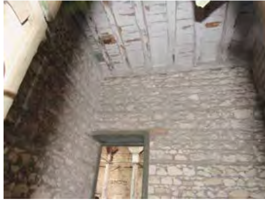
Figure 11. (c) showing the inner walls and the timber ceiling condition in the women's cold room