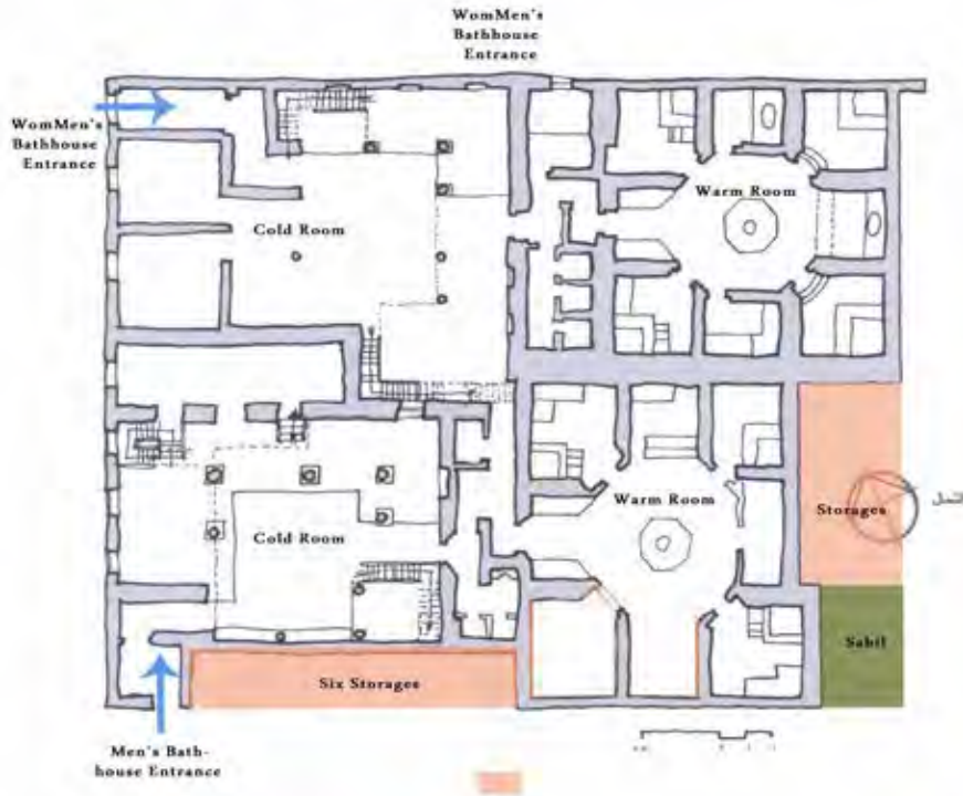
Figure 2. (a) Shows the original spaces usage of the bathhouse