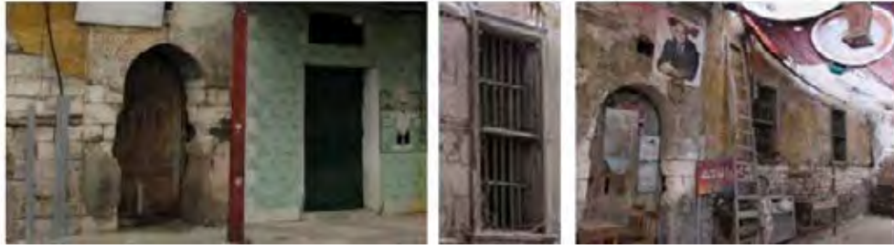
Figure 4. Images show the defective points in the external facades of the bath house