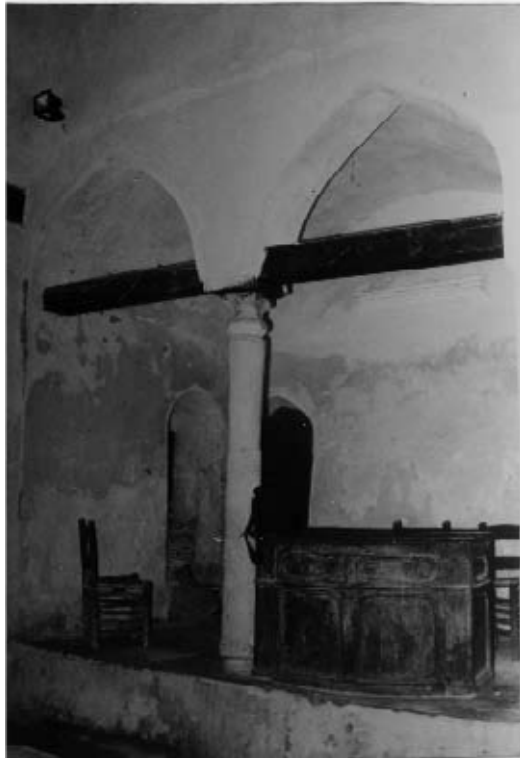
Figure 6. (b): image showing the mater's bench (deket elme'alem)