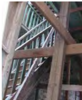
Figure 8. (b): image showing the wooden staircase to the second floor