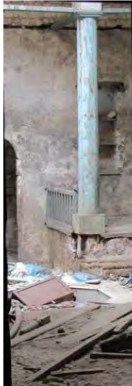
Figure 9. (a): shows the master's bench and the fountain in the women's cold room