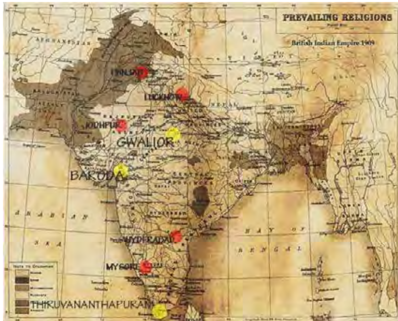
Figure 1. PRINCELY STATES IN INDIA(SOURCE: Princely States Gazetteers of India)

Though there was a lot of building that was raised after the British collaboration. It was required to classify structure from the period of 17 th to the 19 th can be classified into introvert and extrovert structure. These two types of architecture are generally distinct and dominant forms of traditional architecture. The inner details or interior of the structure are more oriented towards traditional architecture and style that is practiced, while the external architecture or exterior design details the collaboration of different style.