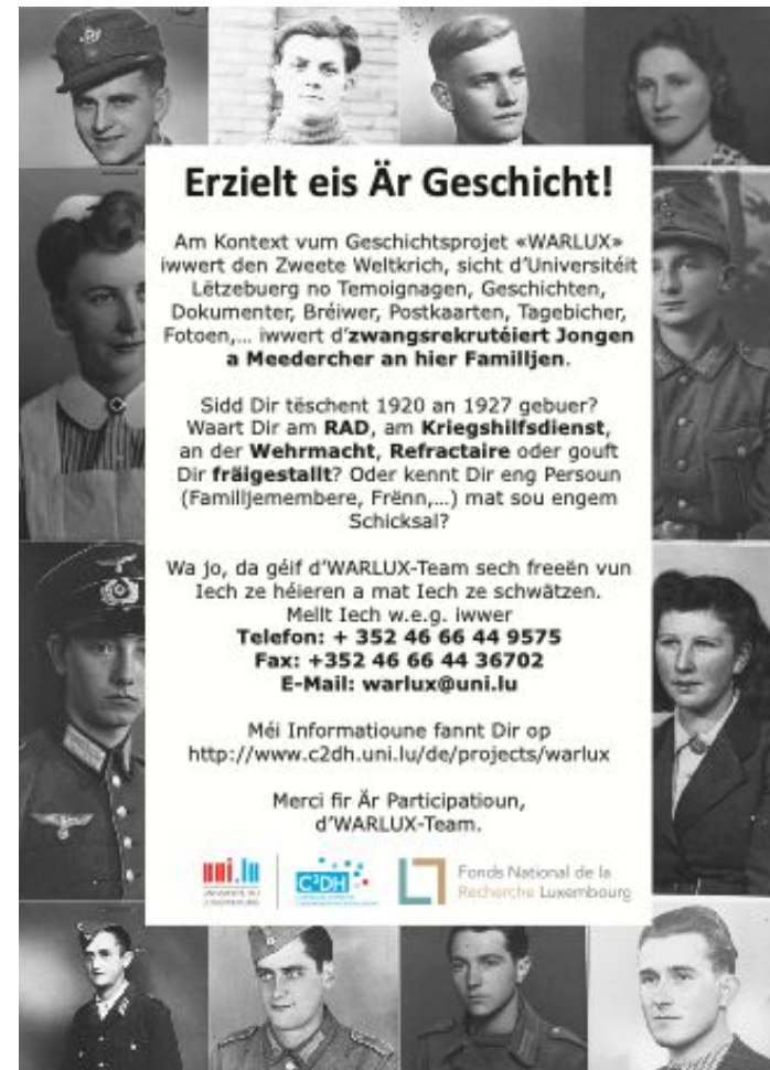
Flyer WARLUX, February 2021