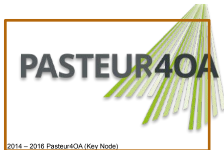
2014 – 2016 Pasteur4OA (Key Node)