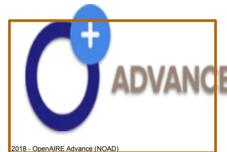
2018 - OpenAIRE Advance (NOAD)