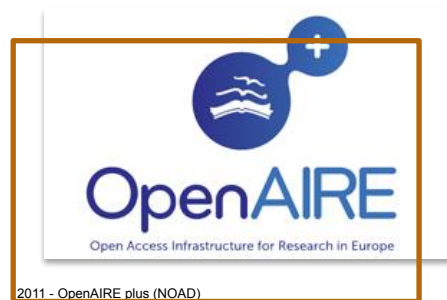
2011 - OpenAIRE plus (NOAD)