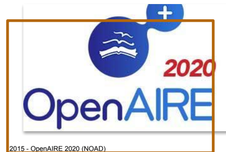
2015 - OpenAIRE 2020 (NOAD)