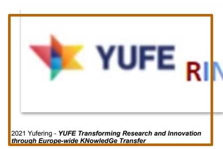
2021 Yufering - YUFE Transforming Research and Innovation through Europe-wide KNowledGe Transfer