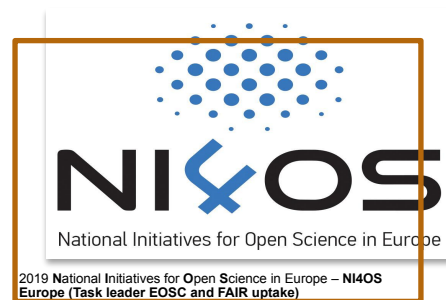
2019 National Initiatives for Open Science in Europe – NI4OS Europe (Task leader EOSC and FAIR uptake)