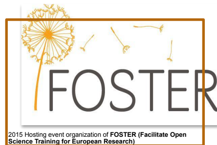
2015 Hosting event organization of FOSTER (Facilitate Open Science Training for European Research)