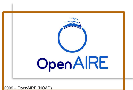
2009 – OpenAIRE (NOAD)