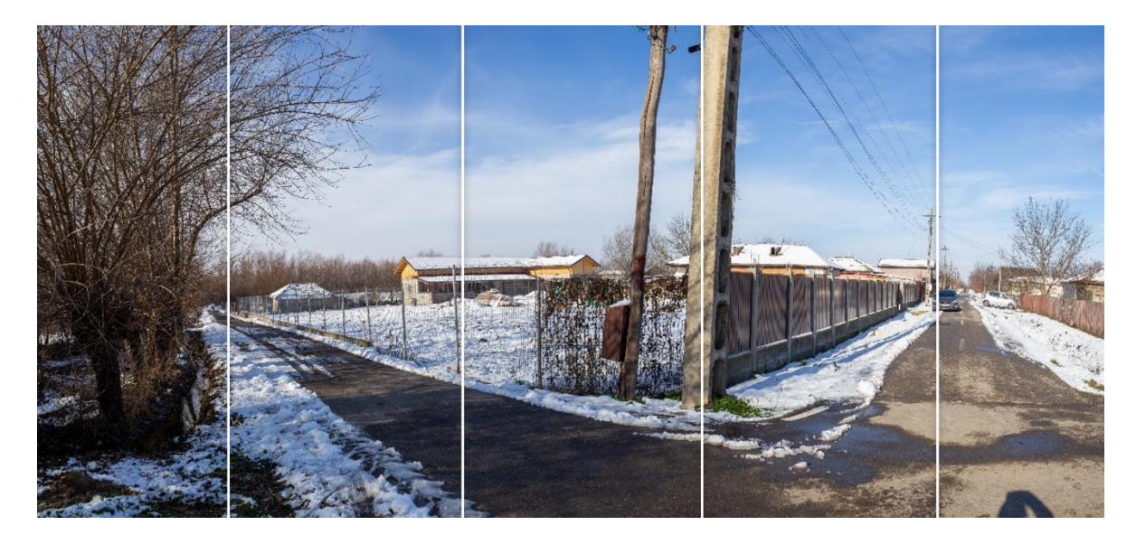
Figure 6. Example of Panoramic Photography Made of 5 Vertical Photos

If the place of the crime cannot be framed in a single photo, several photos will be taken or the panoramic photography procedure will be used, which involves taking several photos and merging them in post-processing.