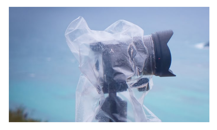
Figure 3. Improvised Weather Protection

To perform this shooting procedure, the casing of the cameras used should be weather-sealed or protected from raindrops and dust particles so that outdoor, atmospherical conditions can not lead to delaying the activity, altering the resulting images, or failing the devices used. For additional weather protection, the following items are recommended for the photography gear: raincoat, umbrella, plastic wrap, elastic, camera lens, camera sensor cleaning kits, protective camera and lenses covers, and other useful accessories.