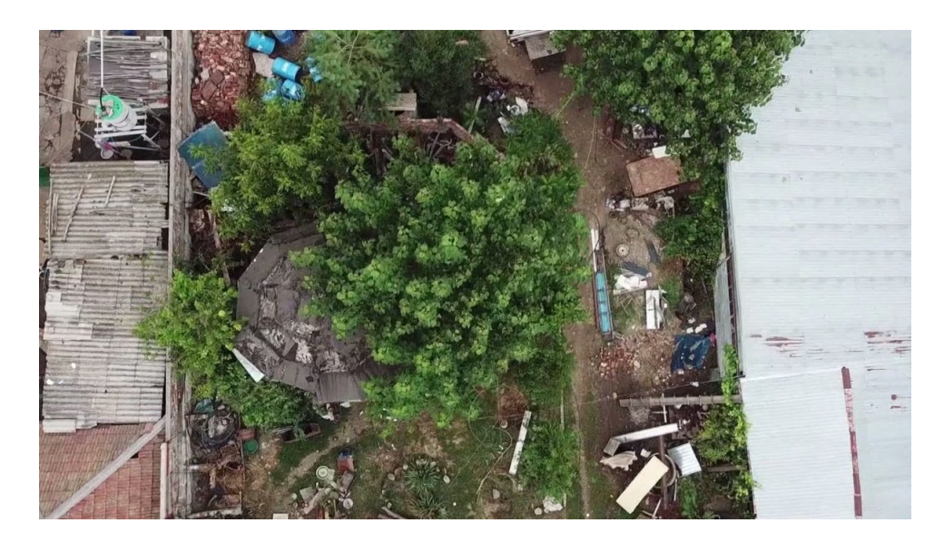
Figure 5. Caracal Case - Aerial Photography Spread In Press

The station point must be chosen so that the image contains as many of the relevant elements listed above as possible. In most cases, it is considered that the camera should be positioned as high as possible, sometimes even using aerial photography. It is noteworthy that, historically, Alphonse Bertillon was the first to methodically photograph the crime scene, both at ground level and above the head, calling the latter process "God's Gaze".