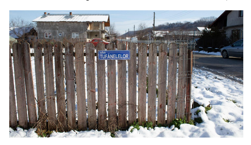
Figure 1. Hypothetical Example of Orientation Photography

The orientation photographies must be taken in such a way as to fully capture the perimeter in which the act was committed, as well as other elements capable of indicating the distance and positioning between this perimeter and the nearest buildings, streets, signs, milestones, barriers or any other elements considered fixed landmarks in the area. In this sense, it can be included a car whose condition indicates that it has not been used, moved from that place for a long time. In the event that the crime was committed in a bedroom, not only the entire apartment will be photographed, but also the exterior of the building (the landing, the staircase of the building, as well other elements mentioned above).