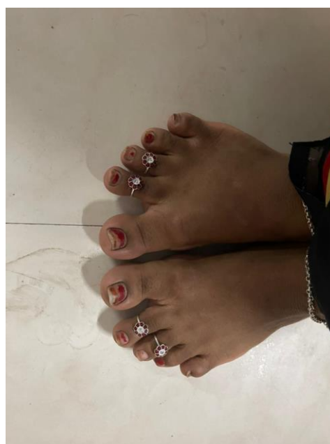
Figure 4: Large Feet In Acromegaly