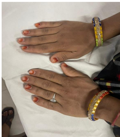
Figure 3:Large Hands In Acromegaly