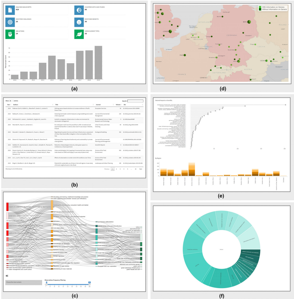
Fig. 3. Examples of dashboard elements for the visualization, summarization, and narration of findings. (a) Key indicators for aggregate statistics, e.g., number of relevant records, identified ecosystem services, number of records per year; (b) references, linked to the publication via its DOI; (c) Sankey chart for the summarization of variables, and an at-a-glance overview of relationships between the different categories of reviewed variables; (d) mapping of case studies in the form of a choropleth map combined with local chart signatures; (e) customizable summarizations; (f) use of various chart types across the dashboard, including, e.g., sunburst charts, that allow data drilling.

Finally, to promote transparency, the dashboard should enable a more immediate dissemination of findings. This is achieved in two ways: First, data is made accessible and retrievable. This is done, on the one hand, through providing a spreadsheet for download. This spreadsheet is one-hot encoded, i.e., data is provided in a normalized form, so that it can readily be used for querying and statistical analysis. On the other hand, a report document can be obtained that includes maps, charts, (cross-)tables, narrative elements, and references. This document is generated from a parameterized R Markdown report [30], so that the document content reflects the filtered data as selected by the user. Second, direct links through the DOI are by directly linking to the analyzed records via their DOI.