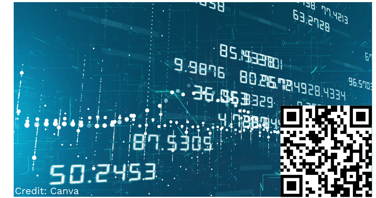
#sensitivedatasharing Criminology + Journalism