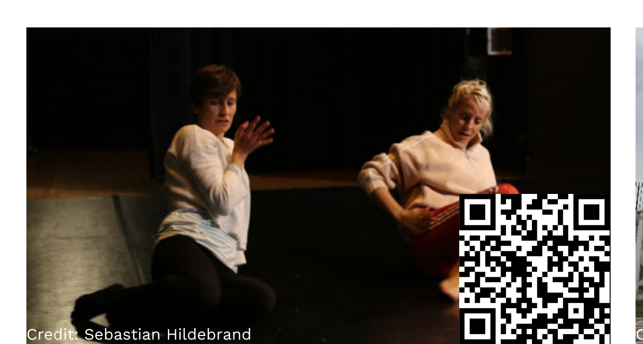
#dancingphilosophy Philosophy + Dance/Choreography