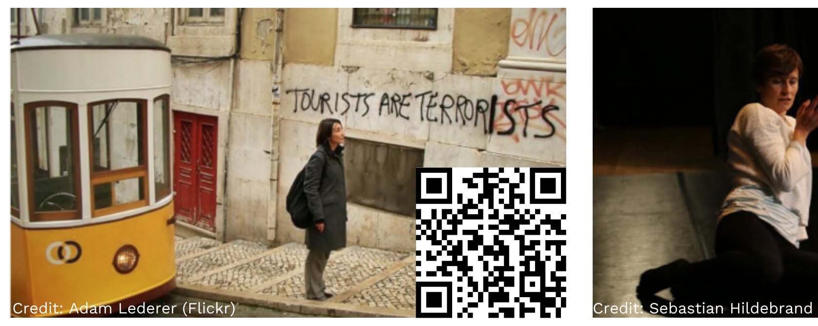
#tourismobservatory Anthropology + Environmental NGO members