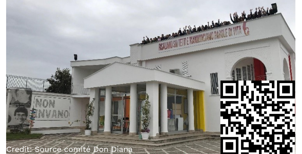
#solutionsjournalism Political Science + Journalism