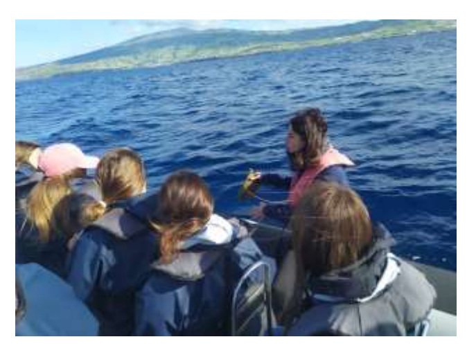
Figure 2. Ocean ProTec.Lab Live Experience: an on-board talk about maritime tourism operations.

Altogether, the immersion experience provided a range of Maritime and Ocean Literacy education and technical skills training to VET and secondary school students.