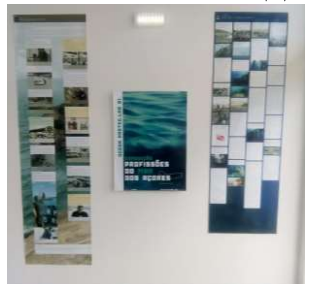
Figure 1. Exhibition "Sea Professions" displaying posters from the activity "Sea Reporters".

the public. The selected team presented the previous activity and also an Open Letter about challenges for maritime professions.