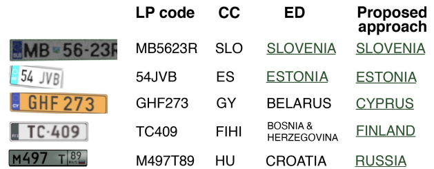
Fig. 1. Examples of country recognition. LP code and CC correspond to detected license plate and country code characters. ED and Proposed approach correspond to predicted country of origin using unweighted Edit Distance and our proposed approach, respectively. Green and underlined corresponds to correct country prediction.

advantage of visual similarity of different characters, confidence scores predicted by detector, and individual importance of each operation in ED. The proposed weighted metrics can be applied to any other string matching tasks in detection-based Optical Character Recognition. Importantly, the proposed approach is lightweight and independent of the underlying object detector, allowing its applications on edge devices. Experimental evaluation on 1158 real-world images shows the superiority of the proposed weighted approaches as opposed to conventional unweighted variant.