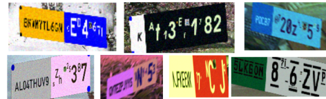
Fig. 3. Examples of artificial images used for training the detector.

Table 1 shows the obtained results for three distinct image sizes, with ‘LP’ and ‘CC’ corresponding to the accuracy of LP and country code prediction, respectively, and ‘Country’ - the accuracy of the country of origin prediction using different approximate string matching metrics. ‘LP+Country’ denotes the accuracy of the full license plate prediction, i.e, where both License Plate and country of origin were correctly established. Note that in all experiments we only considered a LP code or country code prediction to be correct when all of its characters are matching with the corresponding groundtruth. We evaluated our proposed weighted metrics along