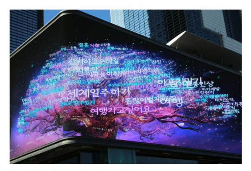
(Fig. 5) Pivotal Tree by Pivotal Lab, 2020

with the seasons and the weather, and its overwhelming size on the exterior wall. In addition, as the media facade is real-time online art, the citizens can hang their wishes on the pivotal tree on the screen. One of the Korean folk cultures is hanging wishes on the Pivotal Tree, which was regarded as a square in the past. The artist group brought it to the Koreans living in a technology-oriented society. With this, viewers turn into participants and produce image texts together. In this video, the participants keep filling the blanks with their stories, and the images change perpetually; it is never completed but only progresses. The tree stands in the middle of the majestic screen, and as its background changes to black, messages from all over Korea keep expanding, much like growing leaves. As ideas from the public fill the blank with Hangul, Korean, the black-coloured blank extends.