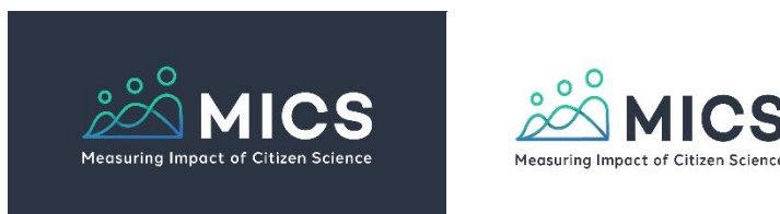
Figure 1. MICS logo

The logo includes the short name (MICS) and the sentence “Measuring Impact of Citizen Science”. It intends to capture the attention of the audience. The logo is used for any (internal or external) deliverable, report and dissemination action.