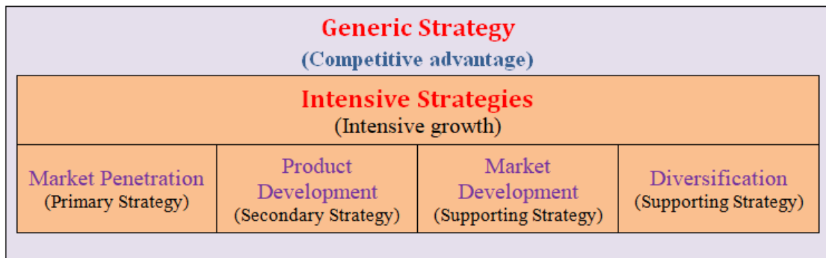
Fig.1: Microsoft’s generic and intensive strategies alignment

Microsoft Corporation has adopted two classes of strategies - generic and intensive growth strategies to keep company at competitive advantage in the PC software and hardware business. As shown in below Fig. 1, its generic approach directly intensive approach. This arrangement optimizes companies overall performance. Generally, the generic strategy of a company shows the overall approach to ensuring company competitiveness and intensive growth strategies outline the methods used to guarantee company growth & development.