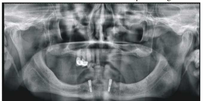
Figure 1: OPG to Check For the Implant Swiss Implant Position.

Locator abutment have dual retention, self-aligning feature with different levels of retention. Proper fitting of each