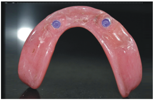
Figure 3: Retentive Locator Inserts Fixed Into Denture Surface.