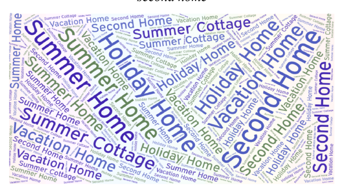
Figure 1: Word cloud with the most used words related with second home

Scopus currently has in its records approximately 80 million articles, more than 27,000 scientific journals, more than 1,500 books and more than 700 conference proceedings in different disciplines. At the same time, it provides reliable and consistent metadata, with relevant information about the publications, as well as about the authors and references of the articles. To justify the choice of Scopus, (Ahmad et al., 2020) proposes some advantages of using Scopus compared to other databases. In particular, the authors state that Scopus has a very wide coverage of academic journals, thus the coverage of citations is also very wide. On the other hand, it is important to consider that Scopus database discriminates against other languages than English and against many scientific sources, so the number of publications could be higher. Also, one of the disadvantages of bibliometric approaches is the inclusion of a lot of literature that mentions the term second home, but does not actually deal with second home tourism, but with other aspects of destination development.