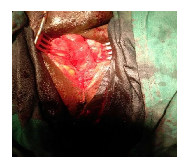
Figure 5: Urethra after Reconstruction