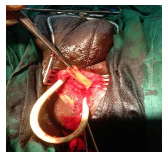
Figure 4: Urethra lay open with the graft