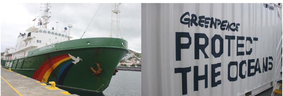
Figure 2. MV Esperanza in the Horta harbour (left) and the brand new Greenpeace scientific lab ready to be used (right).