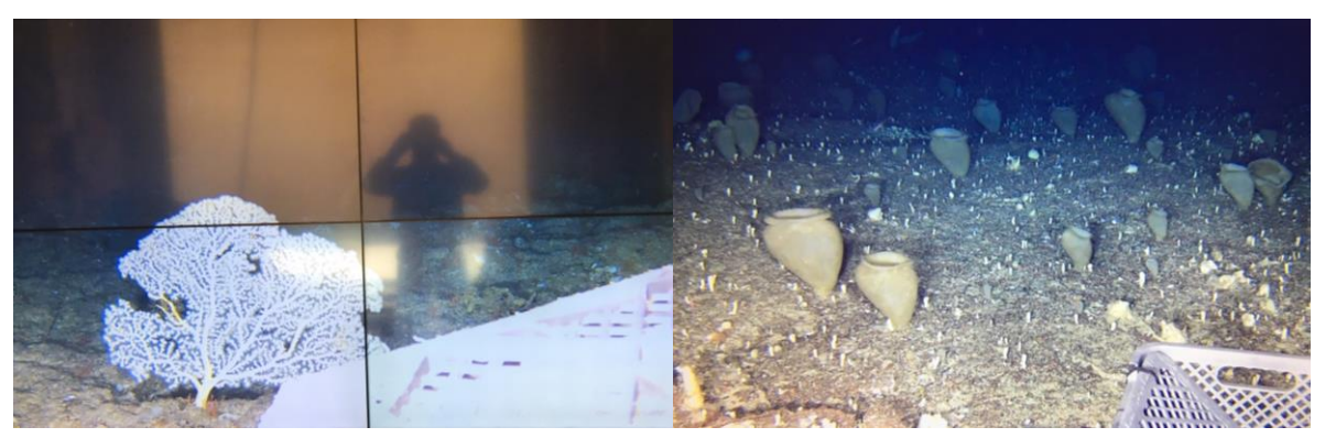
Figure 4. Some of the communities observed in Beta seamount. One large colony of Paragorgia cf. johnsoni (left) and a sponge aggregation composed of Rossellidae (cf. Asconema ).

team tried to solve the problems until 17:00 but with no success. The ROV stayed in we decided to do point sampling in areas 100m apart. The vessel moved 100m away from the initial position and the ROV explored that area in a radius of about 20m. After that, we moved another 100m and explored the next area until another mechanical failure forced the dove to be aborted at around 18:00. During the second part of GreenP_2019_ROV_D03_st003, we observed a large area covered with digitate sponges, with some massive sponges ( Characella pachastrelloides ) and Poecillastra compressa . In this area we observed some Hoplostethus mediterraneus fish close to the seabed. At about 600m depth, we observed a large sponge aggregation (Figure 4) composed of more than 20 Rossellidae (cf. Asconema ) individuals per 12m² of field of view (our guess). The ROV dive was cancelled at around 18:00 after another mechanical failure.