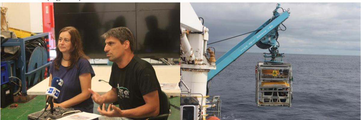
Figure 3. Talking to the media on-board MV Esperanza (left) while waiting for another ROV (right) dive.

Arrival at Beta seamount at around 7:00. Due to the weather conditions, the ROV dive was postponed to 9:00, then 12:00, then 14:00, before being finally cancelled for the day. We gave multiple interviews to the media on board the vessel and did a photo session for the Greenpeace media team (Figure 3).