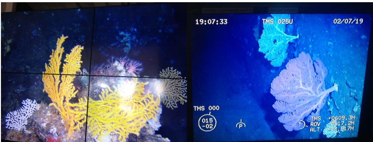
Figure. One of the most characteristic communities observed in the valley between the peaks of the Cavala seamount was composed of large colonies of Paramuricea sp1., Paragorgia johnsoni , and several species of soft corals (Neftidae), including many Anthomastus sp. (left). Some large colonies of Paragorgia cf. johnsoni and Paragorgia cf. arborea were also observed in the valley.