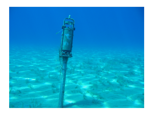
Figure 1: Underwater picture of the instrument. [17]

The ability to interpret information as multi-modal representations might also show important advantages with regards to the estimations and assessments derived by a third perspective of analysis. In particular, the use of two modalities to communicate information might create a start line for further hypotheses and associations between two different representations of the same data. The combination of auditory and visual stimuli may support cognitive processes as a way for triggering cross-modal perception derived from evaluating auditory and visual elements as well as their associations with the actual events.