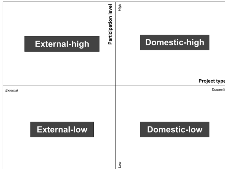
Figure 3. The COMPAIR typology of CS regimes

To understand which of these regimes are present in a country, a significant share of CS projects would need to be mapped along the x and y axis. To get a better sense of where the regime is now compared to where it was before, finished and current projects can be mapped separately, with distributions then compared to identify possible changes over time. Another idea would be to perform two mapping exercises with a time gap of several years to see by how much the regime has changed during this period. It's possible that in some domains (e.g. biodiversity monitoring) the country's regime is domestic-low or domestic-high, while in others it is dominated by external projects with high/low levels of participation. Where this is the case, it would be interesting to understand why some domains 'outperform' others, is it due to funding, policies, societal norms, or something else? The same is also true for the typology as a whole. Future research seeking to validate the framework would need to provide possible explanations as to why the country's regime is what it is, and how to improve it to get to domestic-high (assuming it's the goal), or how others can get to this stage if domestic-high has been achieved. This deliverable lays the foundation for precisely this kind of work that we intended to complete in the future.