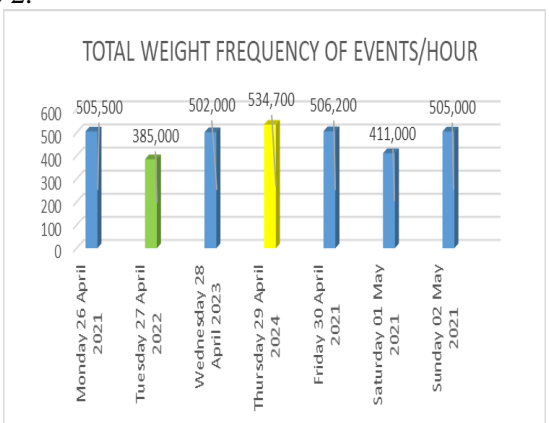
Fig. 2 Side resistance (SF) events/hour

The total weight of side resistance (SF)/hour that has been obtained in 1 week of research on Monday - Sunday, April 26, 2021 - May 2, 2021, can be seen in Figure 2.