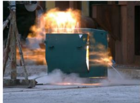
Figure 3. Exploding cabinet station from H21 report ‘Evaluation of Experimental Data from Phase 1B – WBS4 Explosion Severity’ (2021).