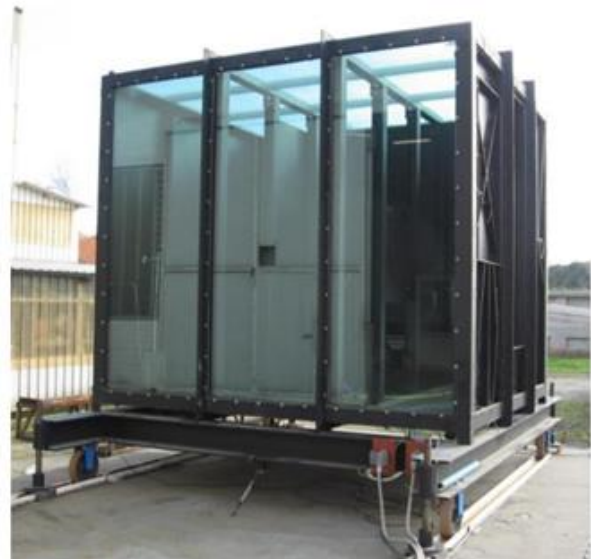
Figure 2. A housing from the Hy4Heat report entitled 'Gas ignition and explosion analysis' (2021).

An explosive mixture was deliberately created and ignited in certain spaces, after which overpressures were measured and analysed. An explosive environment was deliberately created in this research. However, the scope of this research did not extend to the extent to which the explosive mixture studied could actually occur (in practice). As such, the realistic parameters to be determined in the follow-up research described in this document (parameters for the leakage flow rate, amongst other things) are not possible to deduce from this English research. No consideration was given to factors like wind speed or temperature either.