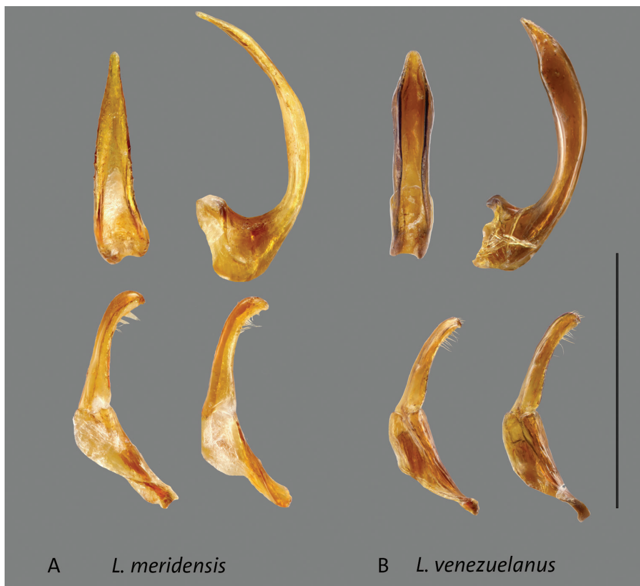
Figure 3. Liodessus spp. nov. Median lobe ventral and lateral views; parameres outer and inner surfaces, L. meridensis (A); L. venezuelanus (B). Scale bar: 0.5 mm.

BOLD platform. We provided 1 entry to our BOLD Liodessus project. The species is well delineated from all other Liodessus , with an uncorrected p-distance of around 9% or more.