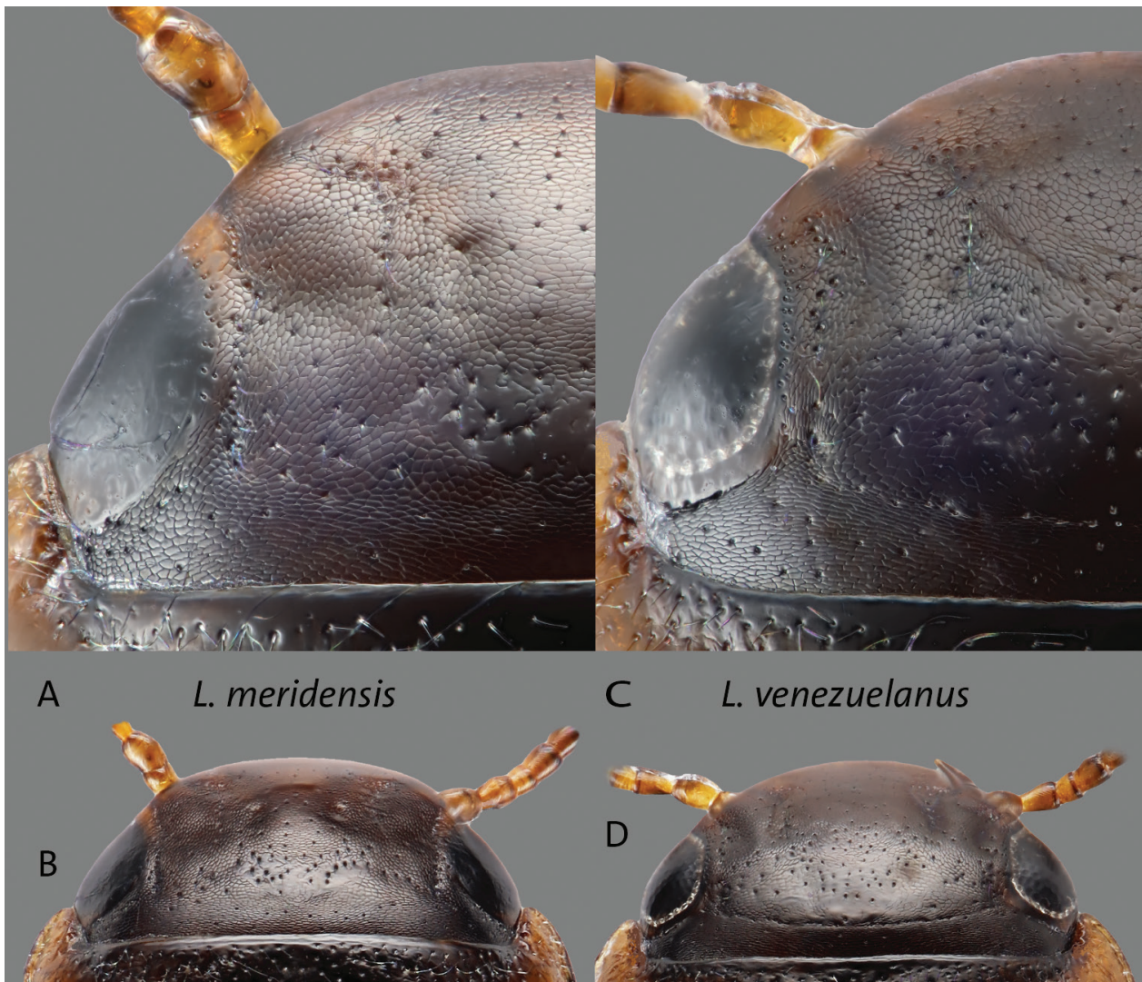
Figure 2. Liodesus spp. nov. Detail of head in dorsal view. L. meridensis (A, B); L. venezuelanus (C, D).

Comparative notes. Distinguished from the other species of Liodesus by the diagnostic combination of the following features: Species from Venezuela; beetle smaller (TL 2.1–2.3 mm); very dark brown to blackish; head without occipital line; pronotal and elytral striae present; wings reduced considerably; shape of median lobe (narrow and “pointed” in lateral and ventral view, with its particular shape).