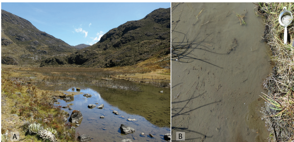
Figure 4. Habitat of Liodessus spp. nov. near Gavidia, Venezuela, where both new species were collected (collecting event VZ10-0123-03A). Overview (A); detail of shallow water at the edge (B).

Structures. Antenna stout. Head with occipital line; with rounded clypeus. Pronotum with distinct lateral beads; with distinct long and deep basal striae (Figs 1A, B). Elytron with short basal stria; without sutural line; without basal epipleural transverse carina. Metathoracic wings not examined in holotype (in paratype: short, about half the length of elytron).