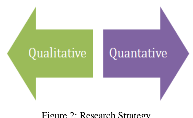
Figure 2: Research Strategy

collecting the relevant data by answering the given question sets. In this scenario, observing and examining the real e-commerce business industry, the researcher has successfully analyzed the relevant data with the help of a modern and advanced technology system.