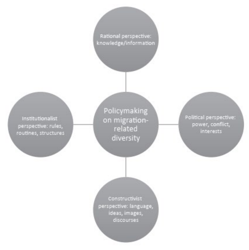
Figure 2. Summary of the four theoretical perspectives