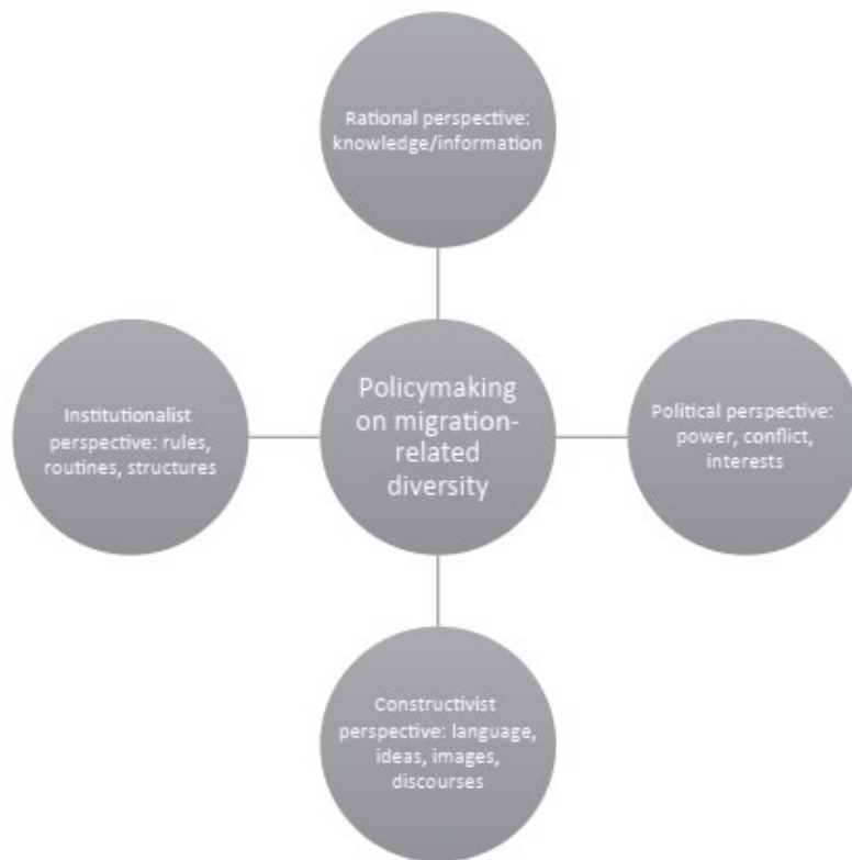
Figure 2. Summary of the four theoretical perspectives