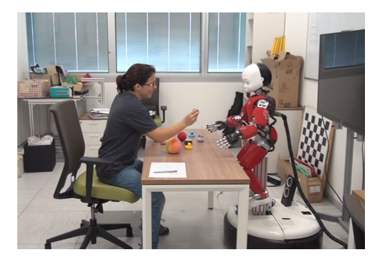
Fig. 1. Image shows a person seated at a table, opposite a standing robot. The robot is the iCub humanoid robot. The person has a selection of toys on the table in front of them, and is holding up one in front of iCub, interacting with it. The robot is looking at the toy with a smiling expression.

robot to understand the participant's attachment style during the interaction, and adapt its behavior to it [12], [13] (Fig. 1).