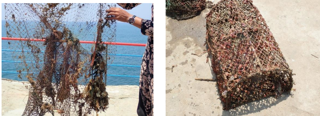
Fig.2. Retrieved gillnet panel and trap

Retrieved traps contained Molluscs, Arthropods, Echinoderms, Annelids and Cnidarians and Poriferans at various degrees of decomposition. Of the total gears retrieved 49% contained organisms. Retrieved traps contained the largest number of animals followed by gillnets. Majority of the organisms were found in Mollusca followed by Echinodermata. The details of retrieved gears/gear parts are given in the table 1. One eighty individual organisms were recorded. Most abundant species recorded were bivalve Perna indica (47.2%). All the organisms were found dead on retrieval. Several researchers have reported the impacts due to lost fishing gear. Bilkovic et al , 2014 reported that 28-38 % of retrieved blue crab traps were actively ghost fishing in the Virginia waters of Chesapeake Bay.