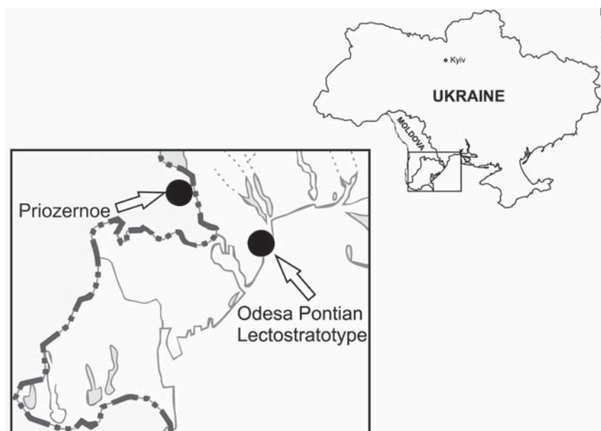
Fig. 1. Type localities: Odesa Pontian Lectostratotype (Ukraine), Priozernoe (Republic of Moldova).

Рис. 1. Типовые местонахождения: лектостратотип понта (Украина), Приозёрное (Республика Молдова).