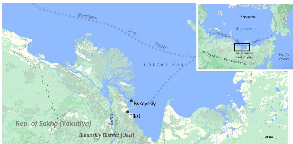
Figure 1 Map showing the location of the main field sites. Author of the map: Alexis Sancho-Reinoso.

At the beginning of what is the town of Tiksi today was the foundation of the polar station ‘Bukhta Tiksi’ in August 1932 (Gukov, 2013, pp. 361–367). It happened within the context of the Second International Polar Year and under the auspices of Komseveroput that was in the final year of its existence. The town itself and the maritime port, located at a distance of a few kilometers from the polar station, came into being in 1933 already under the regime of Glavsevmorput (Gukov, 2013, pp. 302–308) (Figure 1).